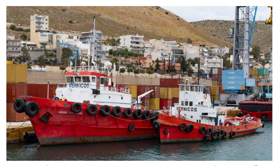
AGIA ELINI and AGIOS DIMITRIOS Greece