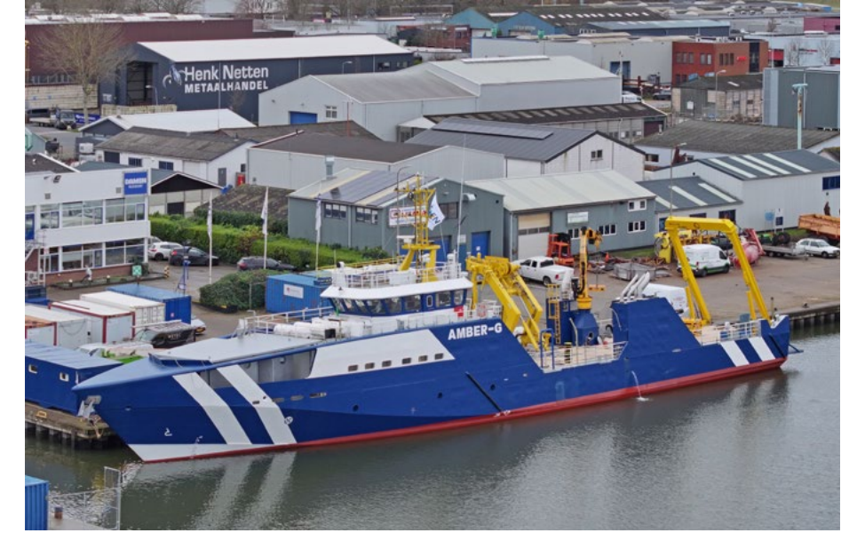
AMBER-G The Netherlands