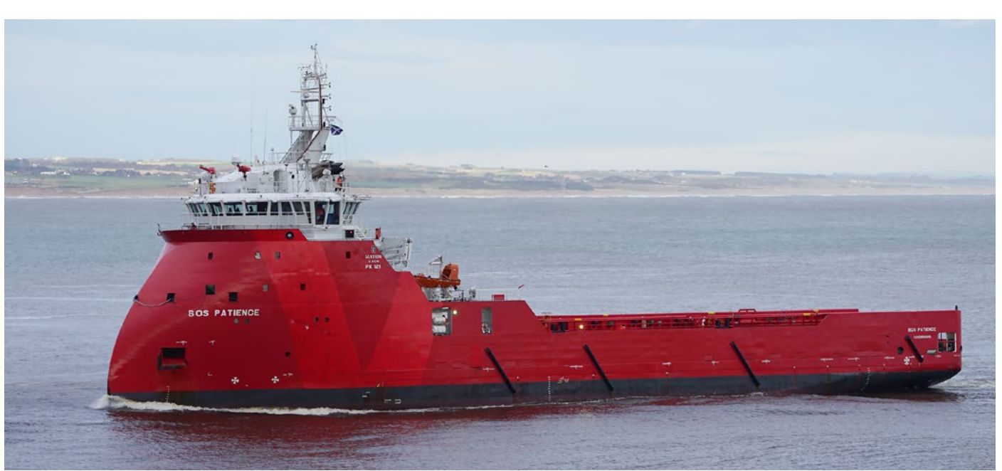
BOS PATIENCE The Netherlands