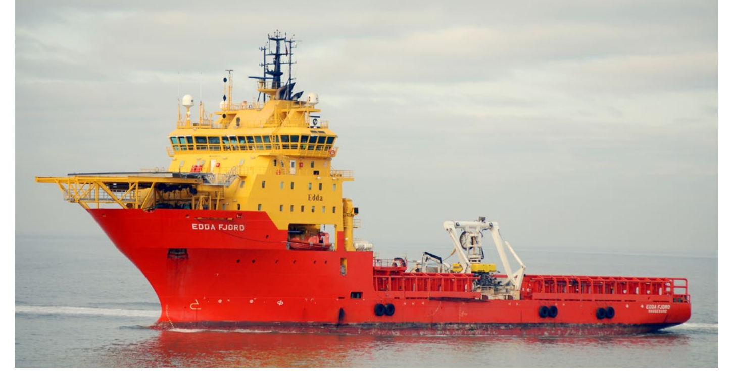
EDDA FJORD Norway