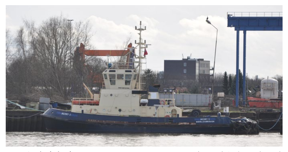
\textit{BERRY} \subset \textbf{United Kingdom}