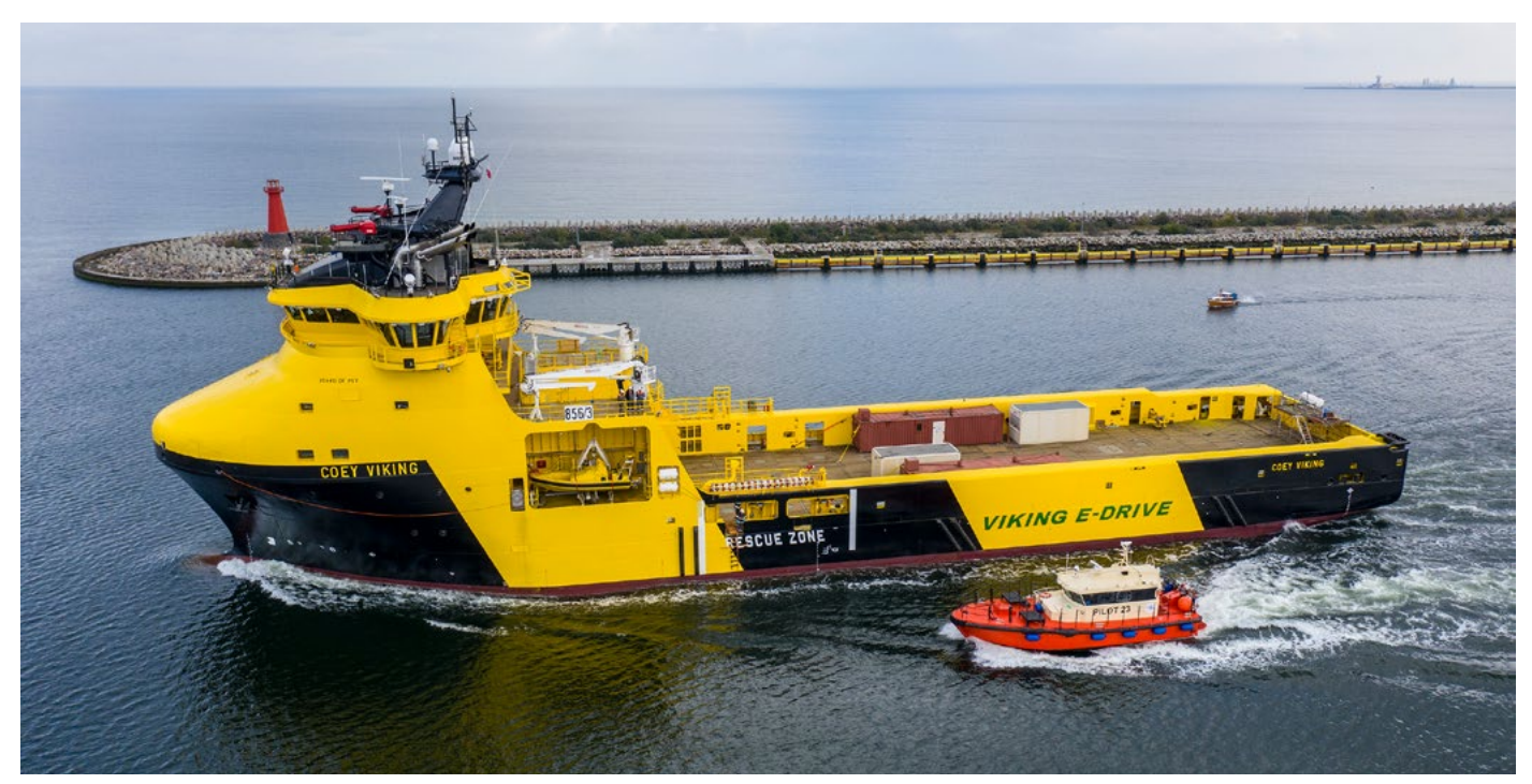
COEY VIKING Sweden