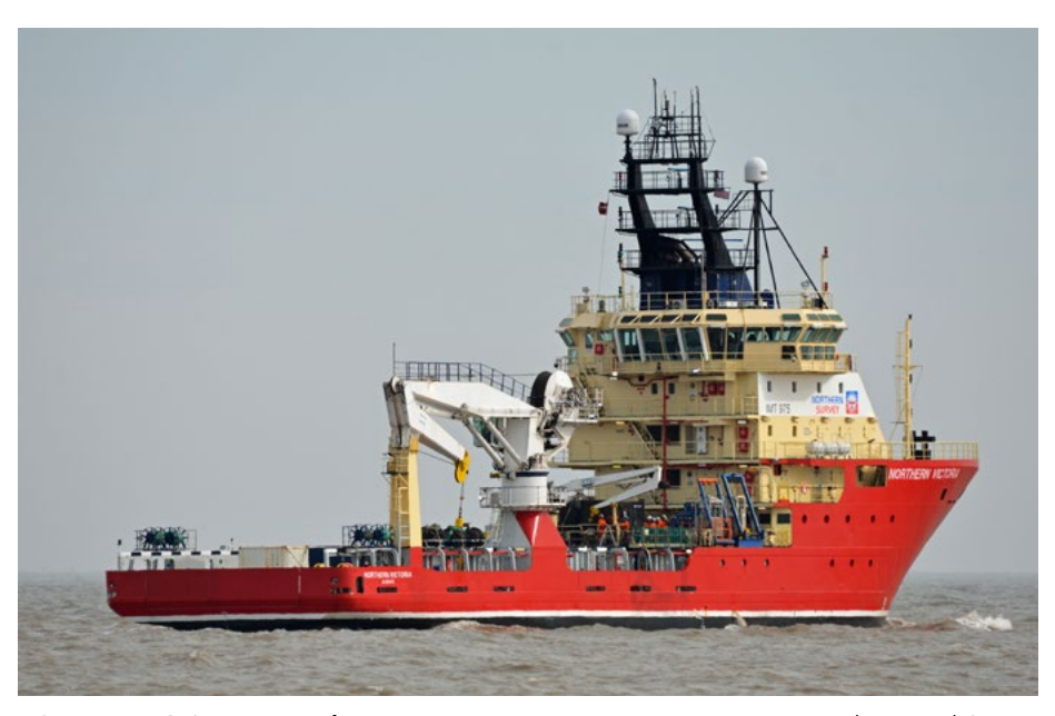
NORTHERN VICTORIA Denmark

AHTS Chu Xin 11, ex Bourbon Liberty 224 '22 (2010 - 9394636) owned and operated by Telasea Logistics Co. Ltd. has been sold in 2023 to Olhai Marine Services