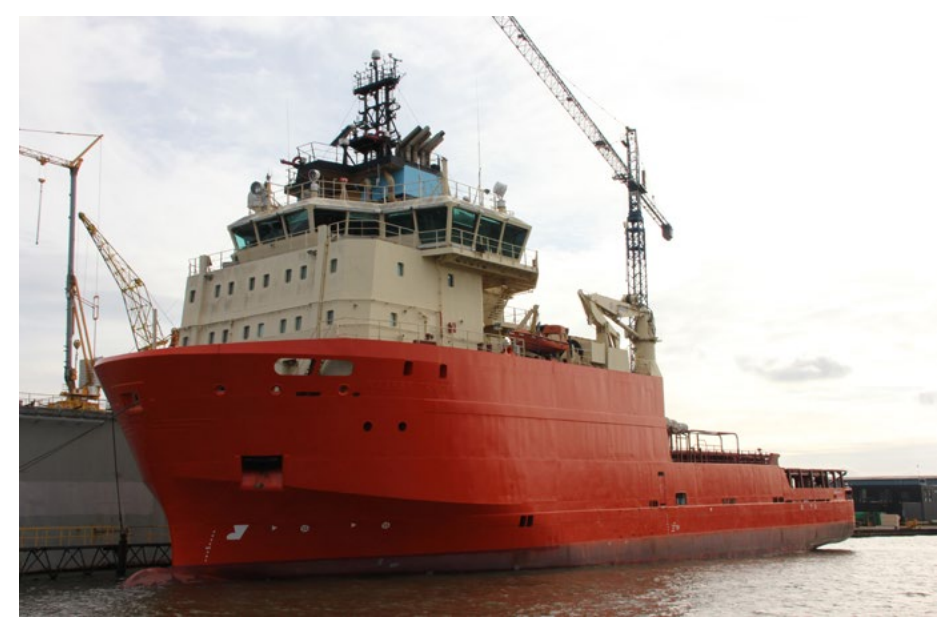
SPM NEEL PRATAP 180 Denmark

OSV Zhong Shang 3, ex Vega Inez '20 (2018 – 9754537) owned and operated by Fujian Funing Shipbuilding Co. has been sold in 2023 to new owner and operator CCCC