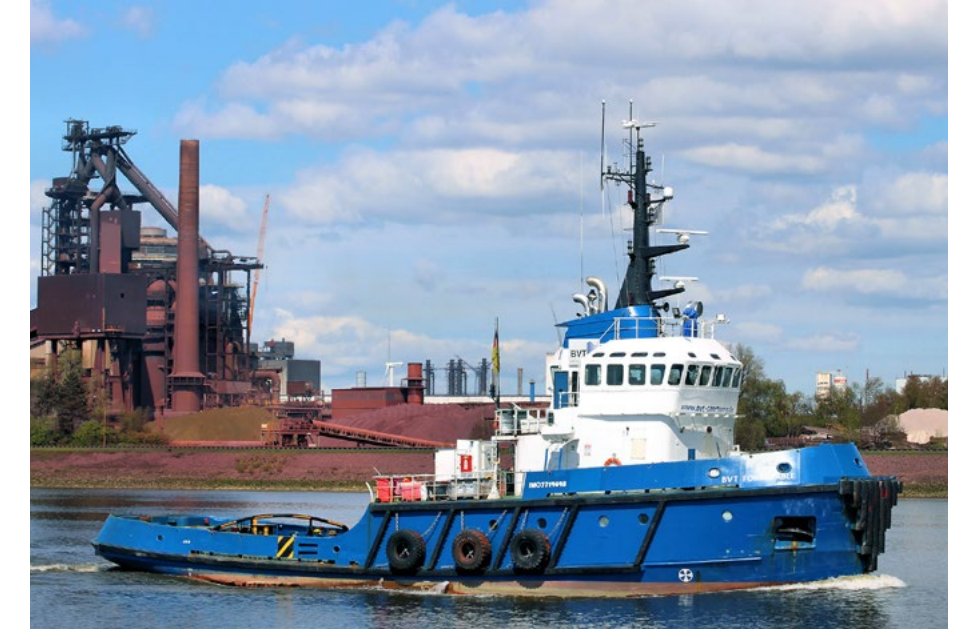
BVT FORMIDABLE Germany