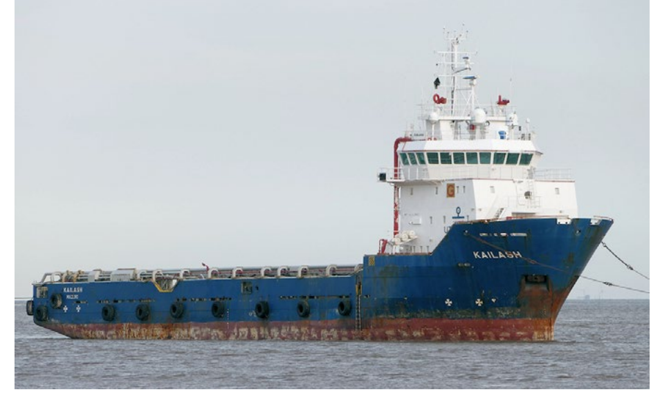
KAILASH The Netherlands