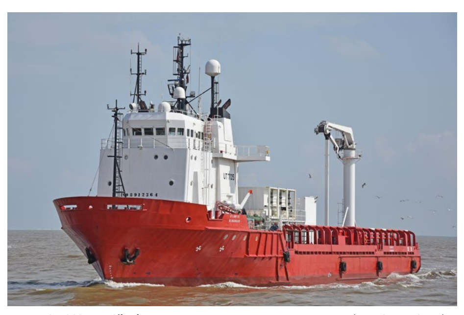
ATLANTIC DISCOVERY Gibraltar

AHTS Bourbon Liberty 201 (2009 – 9394545) owned and operated by Bourbon Offshore Surf SAS has been sold in 2023 to new owner and operator Ships & Boats Oil Services, Alexandria (EGY) and has been renamed Sea Sky .