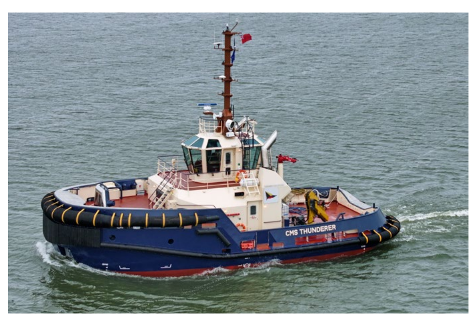
CMS THUNDERER United Kingdom

Tug Boca Grande, ex E.N. Belcher Jr. '90, Coastal Boca Grande '08 (1973 – 7395387) owned and operated by Kirby Inland Marine LP has been sold in 2023 to new owner and operator Louisiana Scrap Metals, Lake Charles, LA and has been renamed LASM-22.