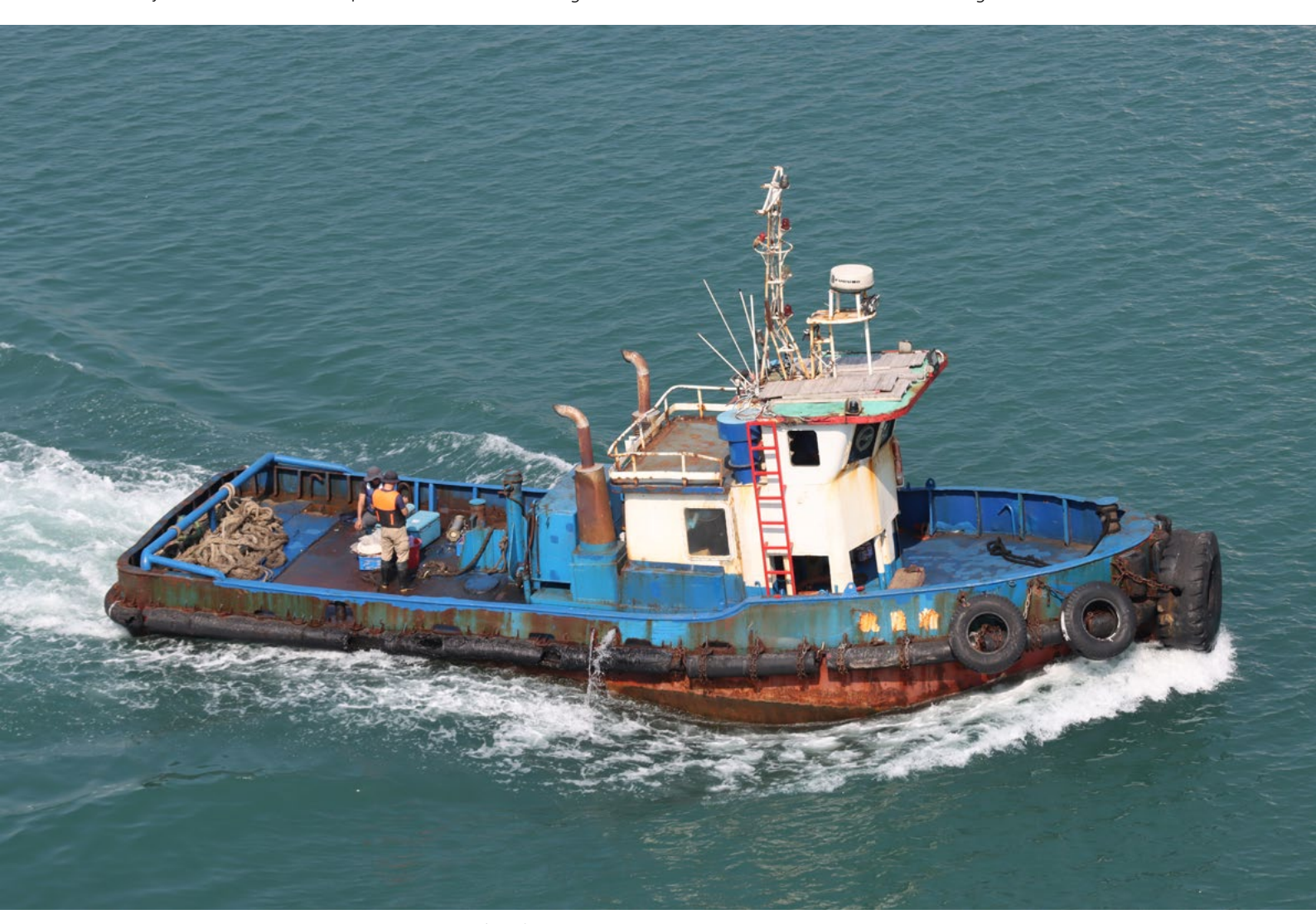
Unknown tug seen on 2 November 2023 in Taichung (TWN).