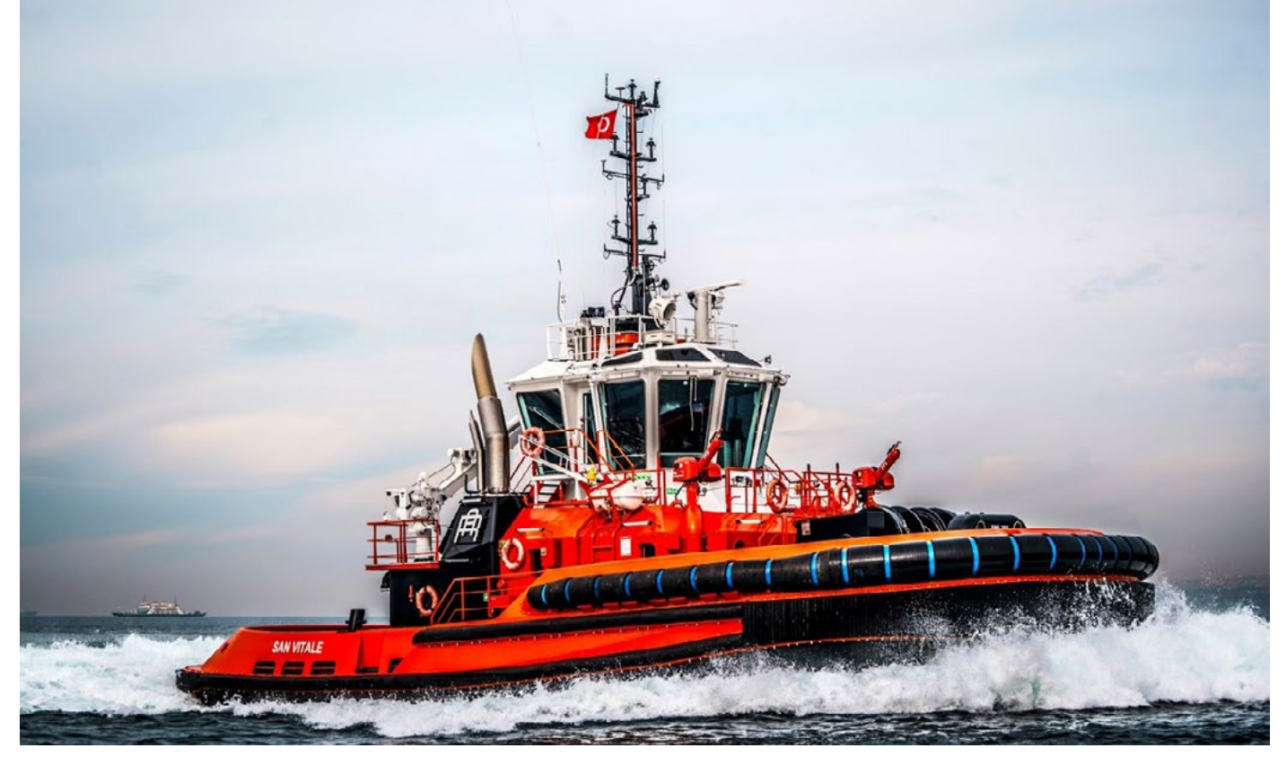
SAN VITALE Turkye

8742616) owned and operated by Black Sea Service, Constanta has been sold in 2022 to undisclosed interest and has been renamed Malta .