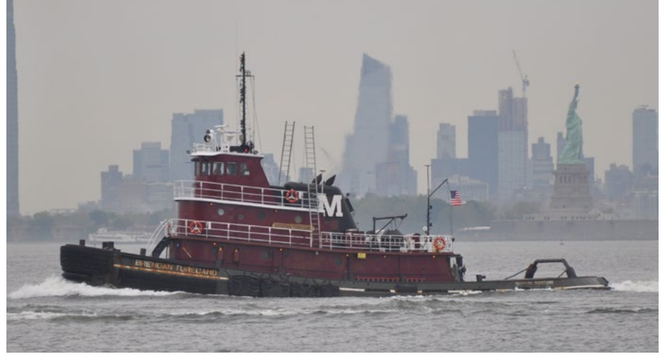
BRENDAN TURECAMO United States

AHTS TC Pacific, ex Borcos Thahirah 2 '20 (2012 - 9559042) owned by Aussie Offshore Services Ltd., operated by Tan Cang Offshore Services JSC has been transferred to new operator Two Offshore Marine Sdn. Bhd., Kuala Lumpur (MYS) and has been renamed Two Pacific. Owner remains the same. AHTS TC Queen, ex Toisa Daring (2007 -9307310) owned by Seahorse Marine & Engineering, operated by Tan Cang Offshore Services JSC has been sold in 2023 to new owner Asineran Ltd., operated by Seahorse Marine & Engineering, Vung Tau and has been renamed Geo Supporter.