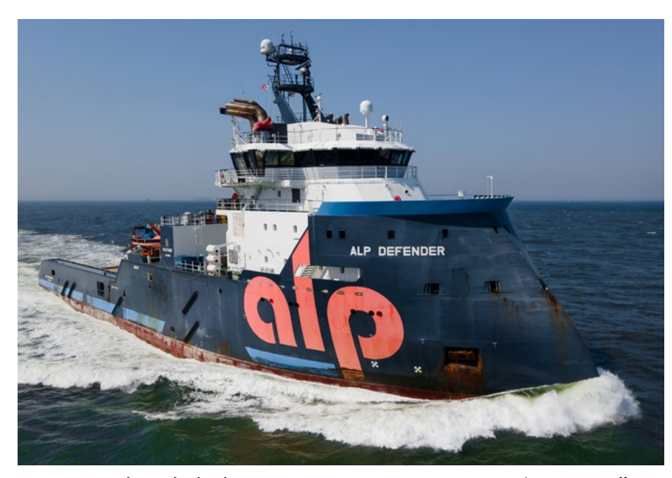
ALP DEFENDER The Netherlands

AHTS Bourbon Liberty 232 (2010 – 9579597) owned by Bourbon Liberty 232 SNC, operated by Bourbon Offshore Greenmar Ltd. has been sold in 2023 to new owner and operator Ships & Oil Services, Alexandria (EGY) and has been renamed Sea Shark.