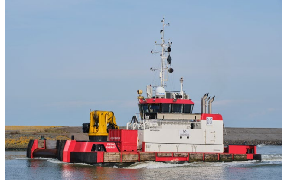
VIKING ENERGY United Kingdom

Tug MIP-5 (2023 – 9974797). Ramparts 2400-SX MK II design. Yard: Sanmar Denizcilik Makina ve Ticaret. 328 GT. Dim. 24,40 x 12,00 x 4,48 mtr. Total: 5.982 bhp. Bollardpull: 75 tonnes. Emission Standard: Tier III. Owner and operator: Mersin International Port, Mersin. Built as Bogacay LIX . Tugs Uzmar 2 (2022 – 9825324) and Uzmar 4 (2023 – 9825336). Yard: Uzmar Gemi Insa Sanayi ve Ticaret. 297 GT. Dim. 23,20 x 11,40 x 4,96 mtr. Engines: 2x Mitsubishi, total: 4.376 bhp. Speed: 11,8 kn. Owner and operator: Uzmar-Uzmanlar Denizcilik, Izmir.