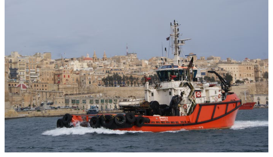
SPINOLA Malta

Tugs Biak 32 (2022 – 9964259) and Biak 33 (2022 - 9976236). Yard: Titian Kaltim, Samarinda. 236 GT. Dim. 29,00 x 10,00 x ? mtr. No further details available. Owner and operator: Titian Mahakam Line, Samarinda. Tug Bluefin VIII (2022 – 9969780). Yard: Survanusa. 210 GT. No further details available. Owner and operator: Tanjung Harapan Selatan PT, Samarinda. Tug Cahaya Raja 02 (2022 – 9975105). Yard: Allvina Prima PT, Samarinda, ynr. SMD/VI/2022. 238 GT. No further details available. Owner and operator: Raja Anugrah Bersaudara, Samarinda. Tugs Danny 98 (2022 – 9968968), Danny 100 (2022 - 9977438) and Danny 106