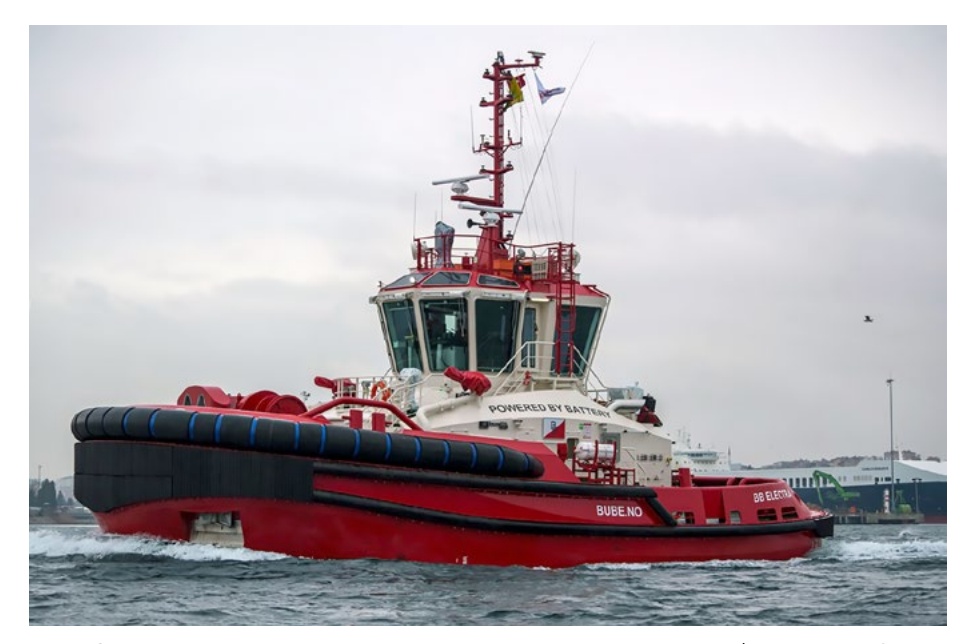
BB ELECTRA Norway