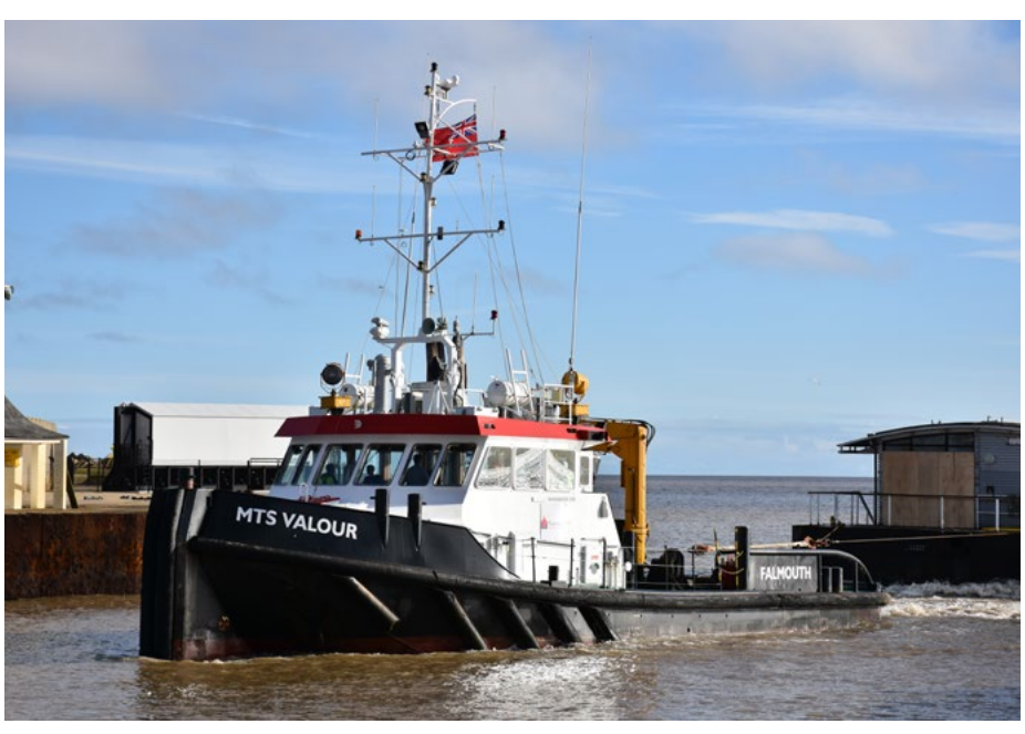
MTS VALOUR The Netherlands

Tug WGM 209 (2022 – 9981099). Yard: Tanoto Shipyard Pte. Ltd. No further details available. Owner and operator: WHS Global Mandiri PT, Jakarta.