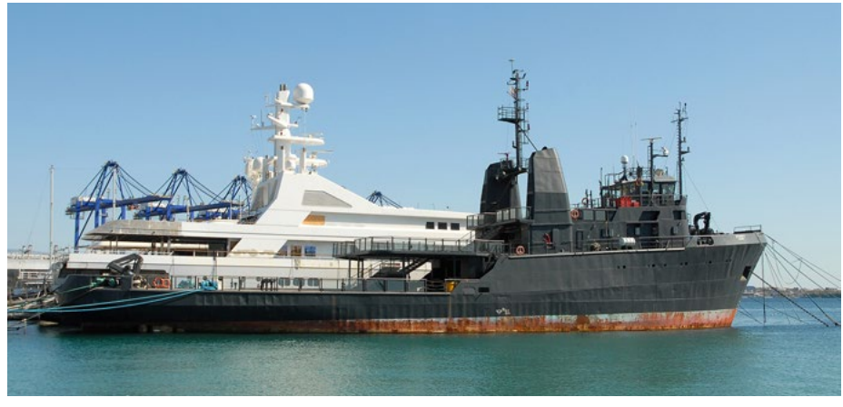
AFTHIONIA V Greece

Tug Annie , ex Dogancay 18 '09, C.M. Annie '22 (2008 – 9429510) owned by Capella Offshore Shipping Ltd., operated by CM Offshore Marine Ltd. has been sold in 2024 to new owner Seven Mile Shipping, operated by Somara, Forth-de-France (MTQ) and has been renamed Maori .