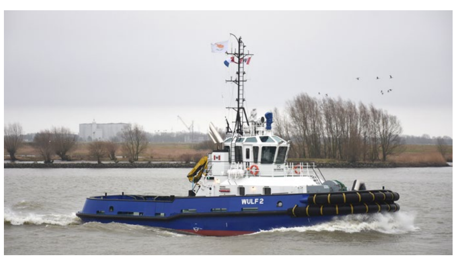
WULF 2 The Netherlands

OSV Euphrates , ex OOC Badger '11, OOC Panther '11 (2011 – 9513866) owned