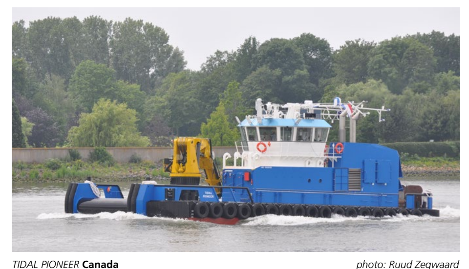
TIDAL PIONEER Canada

Listed below are new constructions, renamings, sales, demolitions of tugs, anchorhandlers and offshore supply vessels that recently have taken place.