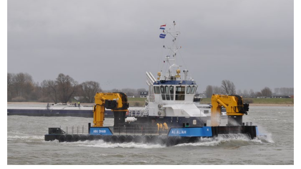
AL ALIAH United Arab Emirates