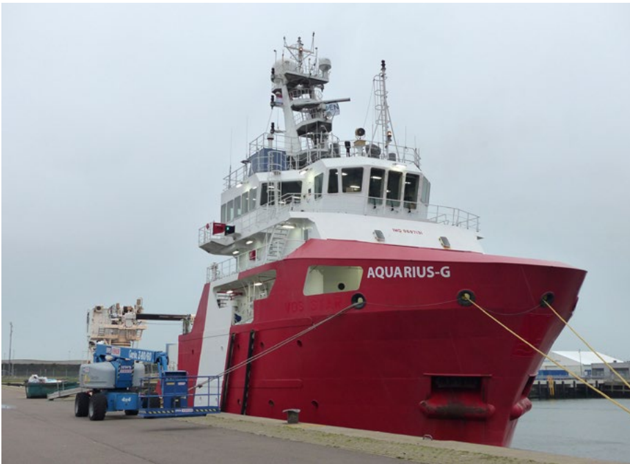
AQUARIUS-G The Netherlands