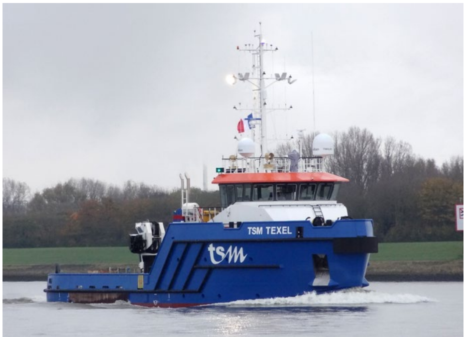
TSM TEXEL France