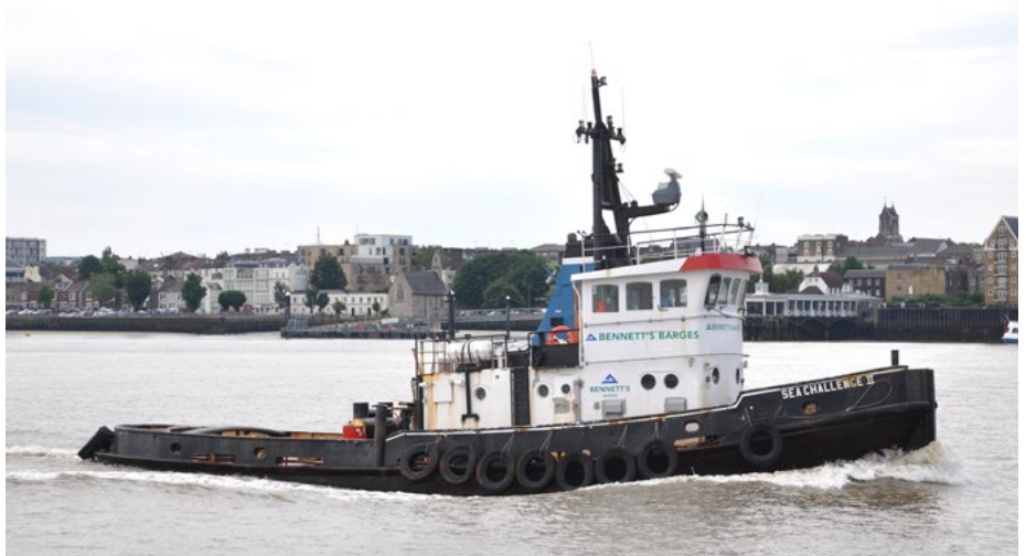
SEA CHALLENGE II United Kingdom

OSV Speciality Operator , ex Gulf Quest '02 , Ocean Quest '19 (2001 – 8968741) owned