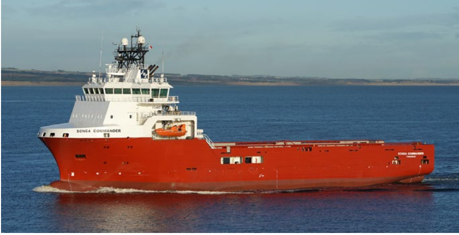
SONGA COMMANDER Norway