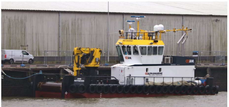
AMS RETRIEVER United Kingdom

OSV Harvey Lion , ex Infant Jesus of Prague '14 (2010 – 9578737) owned by Harvey Lion LLC, operated by Harvey Gulf Int'l Marine LLC