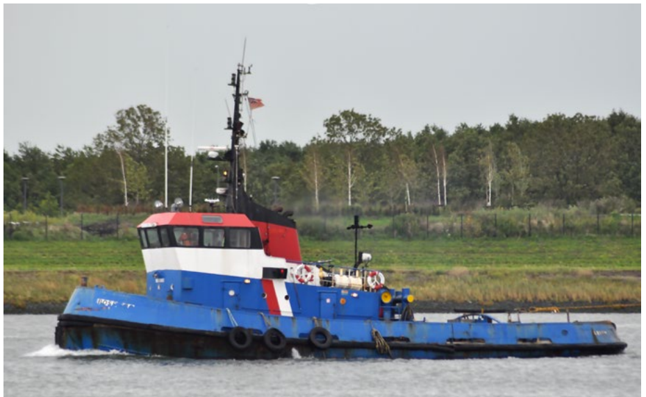
BOSS TUG United Kingdom