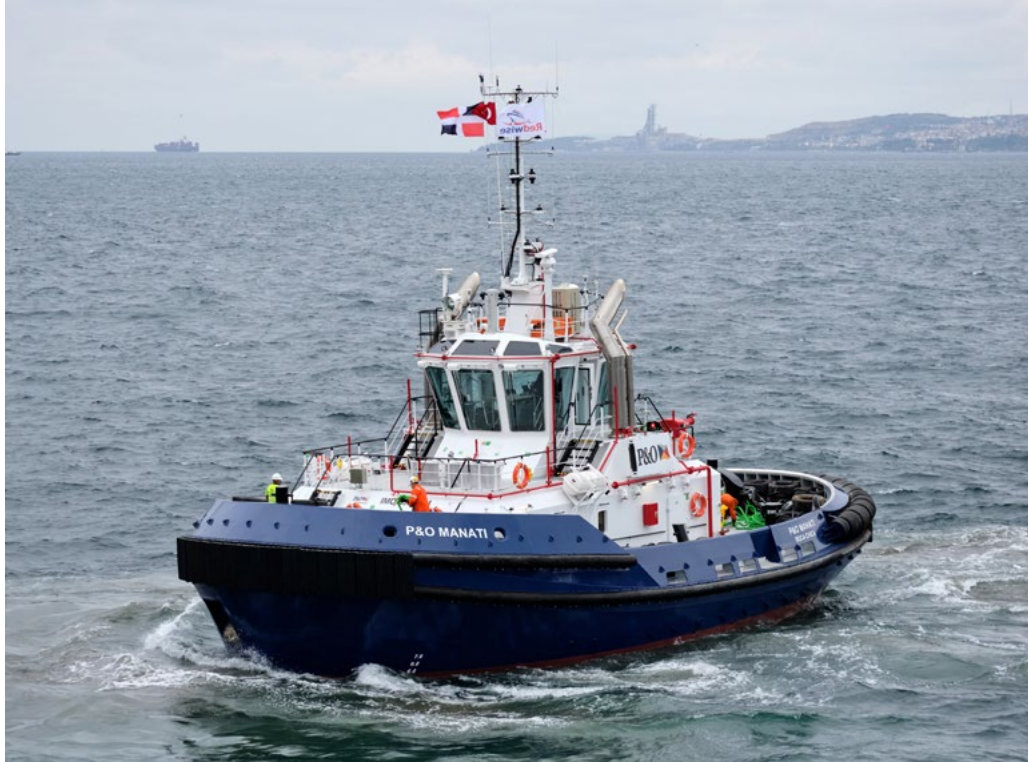
P&O MANATI Dominican Republic

Tugs Chief Dan George (2023 – 9960394) and Saam Volta (2023 – 9960382). ElectRA 2300-SX design. Yard: Sanmar Denizcilik Makina ve Ticaret, Tuzla, ynr. resp. Electra 2303 and Electra 2302. 295 GT. Dim. 23,00 x 12,00 x 5,00 m. Engines: Orca battery bank by Corvus Energy. Total: 4.916 bhp, bollardpull: 70 tonnes, speed: 12 kn. Emission Standard: Tier III. Owner and operator: Saam Towage, Vancouver. Launched resp. as Dynamo II and Dynamo I . Tug HaiSea Brave (2023 – 9942988). ElectRa 2800 design. Yard: Sanmar Denizcilik Makina ve Ticaret, Tuzla. 485 GT. Dim. 28,40 x 13,00 x 5,90 m. Engines: 100% electric, battery bank by Corvus Orca Energy,