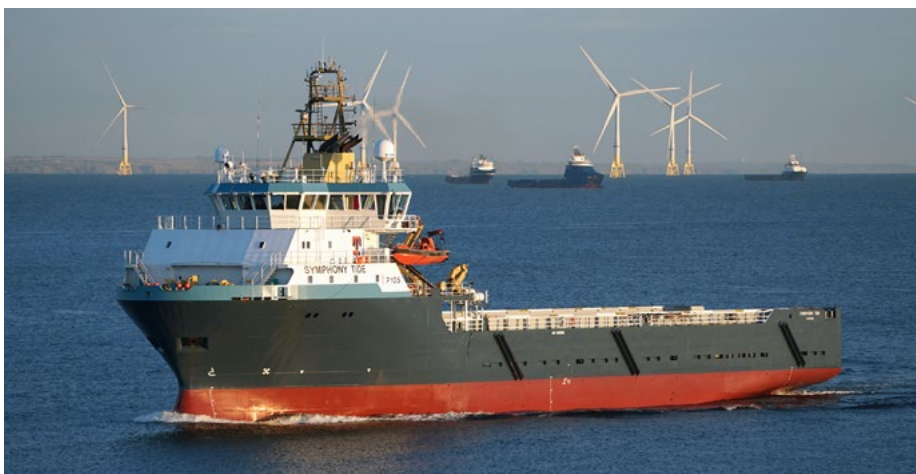
SYMPHONY TIDE Norway