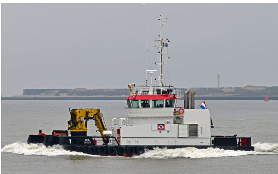
SEA OLOUS The Netherlands

OSV's Normand Scotsman , ex Far Scotsman '22 (2012 – 9616187), Normand Searcher , ex Far Searcher '21 (2008 – 9388950), Normand Spark , ex Sea Spark '21 (2013 –