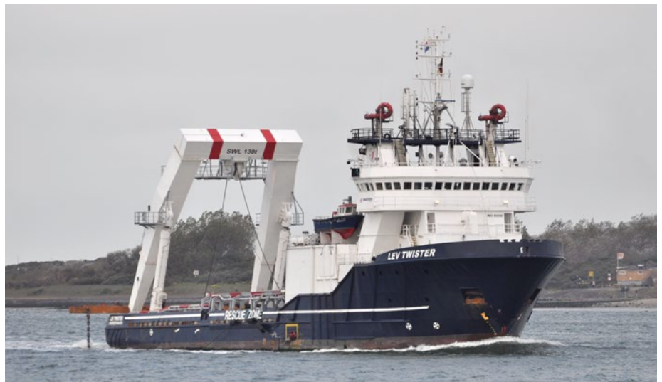
LEV TWISTER Germany

Tug Fairplay-92 (2024 – 9948417). ASD 2813 design. Yard: Damen Shipyards, Song Cam, ynr. 513330. 381 GT. Dim. 27,59 x 12,93 x 5,20 m. Engines: 2x Caterpillar, 3516-C HD/D, total: 6.772 bhp. Bollardpull: 82 tonnes, speed: 13 kn. Owner and operator: Fairplay Borchard, Hamburg.