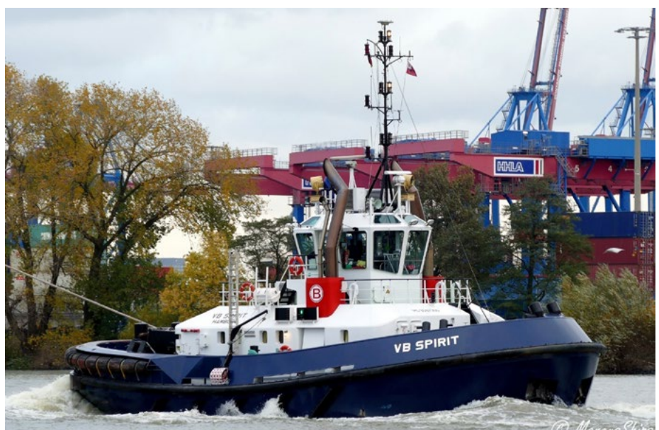
VB SPIRIT Germany