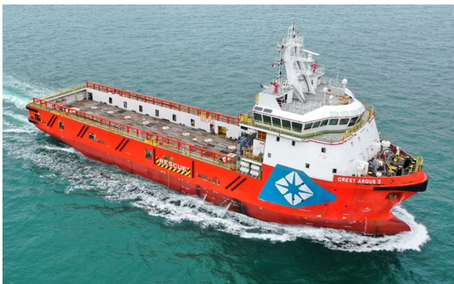
CREST ARGUS 3 Singapore

Tug Svitzer Surrey , ex Sun Surrey '05 , Adsteam Surrey '07 (1992 – 9019468) owned by Svitzer Eastlands Ltd., operated by Svitzer Marine Ltd. has been sold in 2023 to new owner and operator A&P Falmouth, Falmouth and has been renamed Morva . Tug Willpower , ex Sidi Moussa '14 , Sidi '14 (2000 – 9220691) owned and operated by Williams Shipping Marine has been sold in 2023 to new owner and operator Foyle