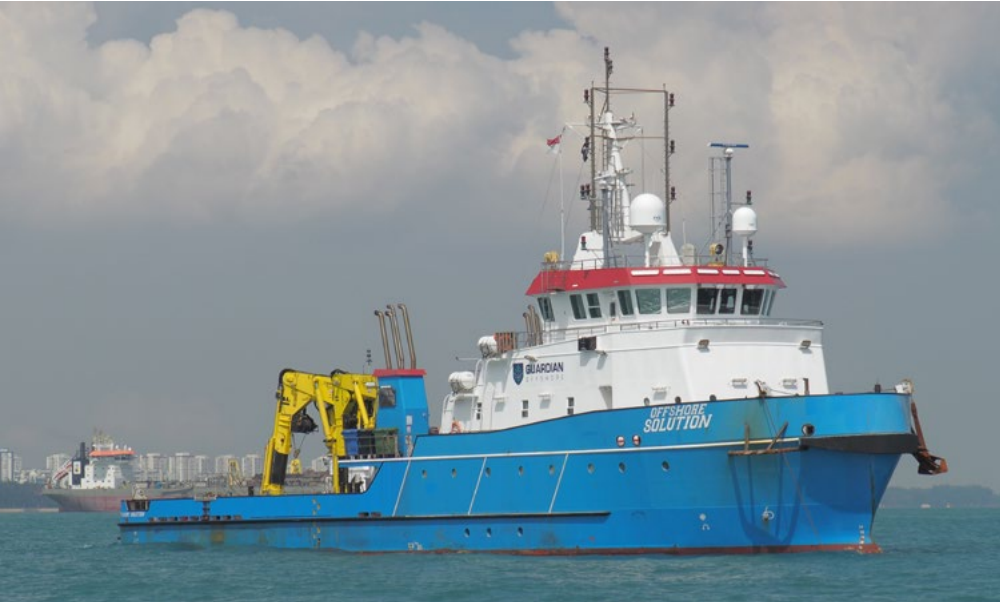
OFFSHORE SOLUTION Australia

Listed below are new constructions, renamings, sales, demolitions of tugs, anchorhandlers and offshore supply vessels that recently have taken place.