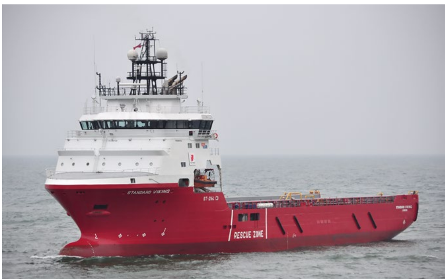
STANDARD VIKING Greece

Tug MBP 2203 (2022 – 9953614). Yard: PT Karya Teknik Utama, ynr. KTU-1328. 207 GT. No further details available. Owner and operator: Maritim Barito Perkasa, Banjarmasin. Tug Pacific Jaya XVIII (2022 – 9967603).