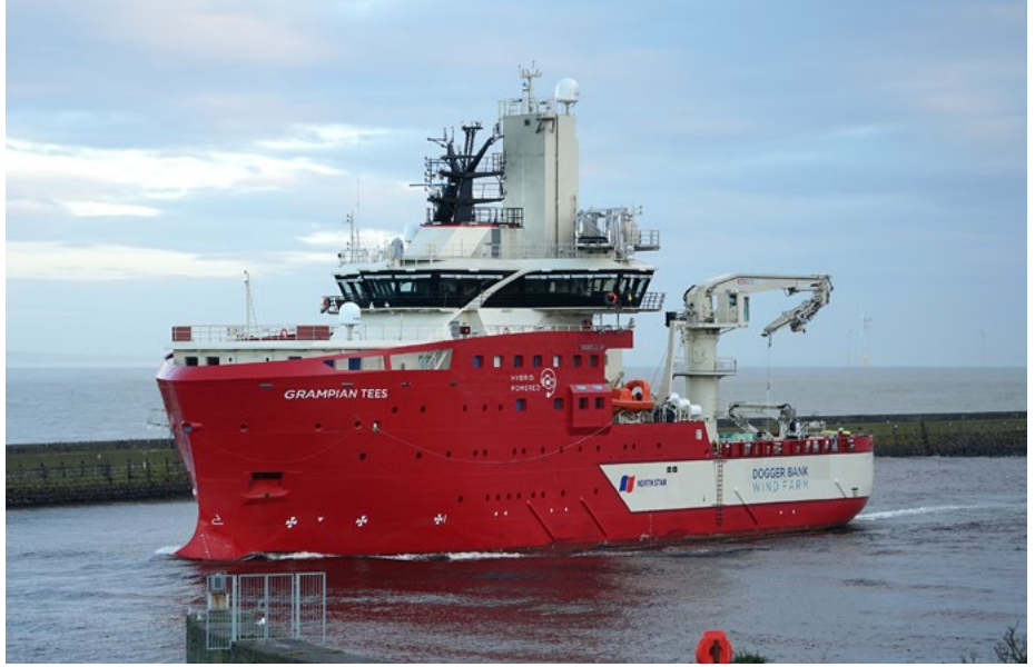
GRAMPIAN TEES United Kingdom

OSVs Topaz Endurance , ex Britoil Power '18 (2015 – 9678769) reported as being sold to