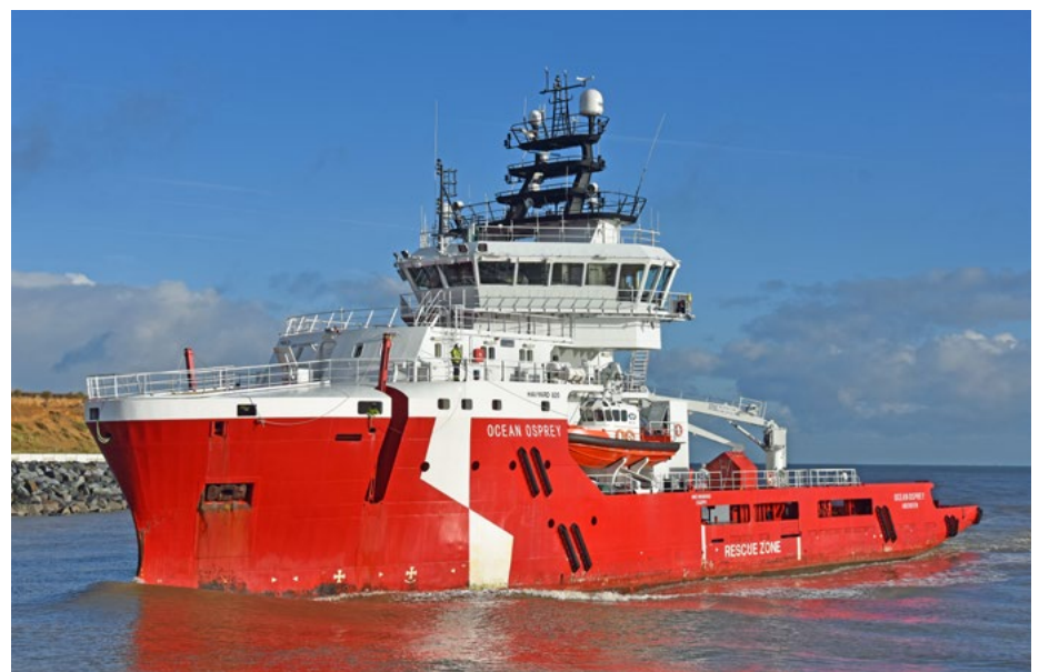
OCEAN OSPREY Norway