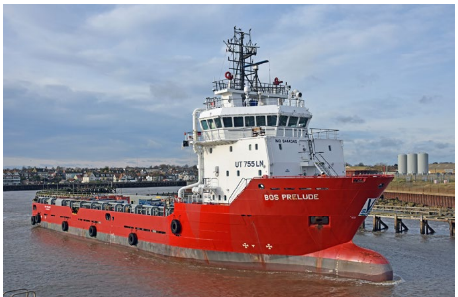
BOS PRELUDE The Netherlands