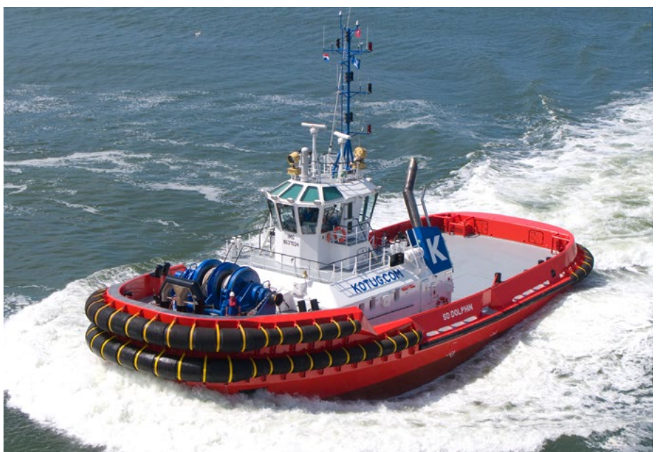
SD DOLPHIN United Kingdom