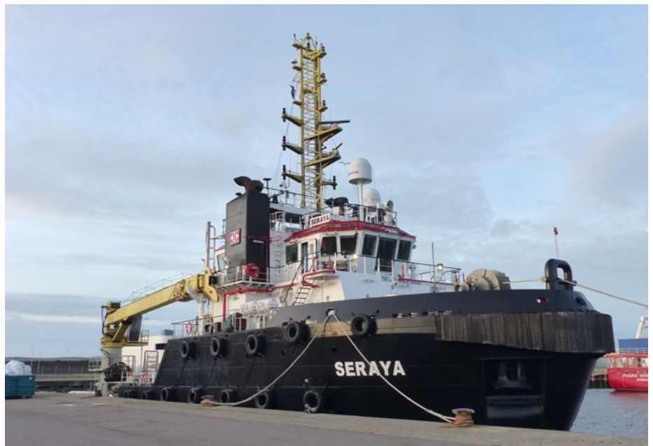
SERAYA The Netherlands