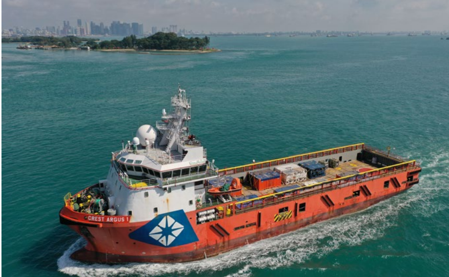
CREST ARGUS 1 Singapore