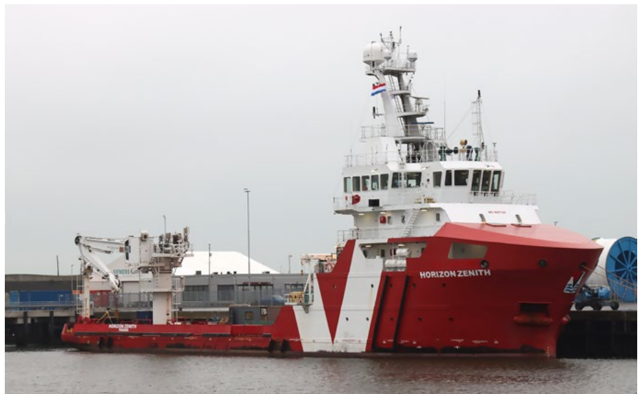
HORIZON ZENITH The Netherlands

OSV VOS Sugar (2016 – 9697129) owned by DSV II Express B.V., operated by Vroon Offshore Services has been sold in 2023 to new owner Energy Sugar AS, operated by Golden Energy Offshore Services AS, Alesund (NOR) and immediately resold to Boskalis who renamed her Horizon Zenith .