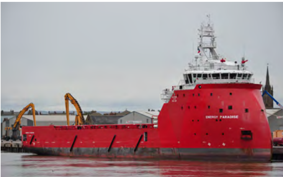
ENERGY PARADISE The Netherlands