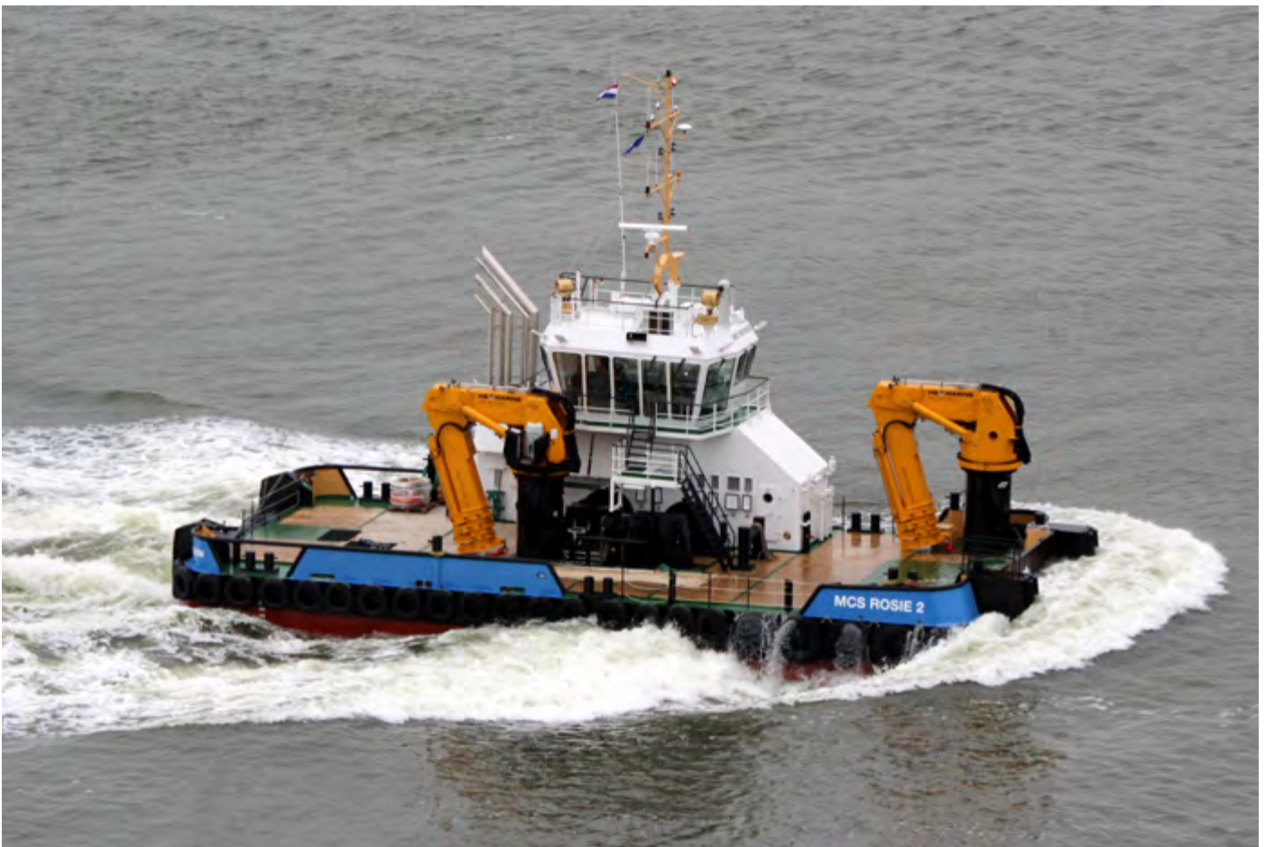
MCS ROSIE 2 United Kingdom