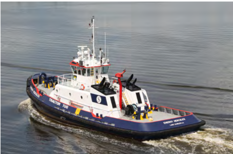
ENERGY HERCULES United States

AHTS Teja , ex Hamal '21 (2002 – 9274783) owned by Teja Marine Inc., operated by Sea Crest Marine Services LLC has been sold in 2023 to new owner and operator Amasus Shipping/Dutch Marine Contractors, Delfzijl