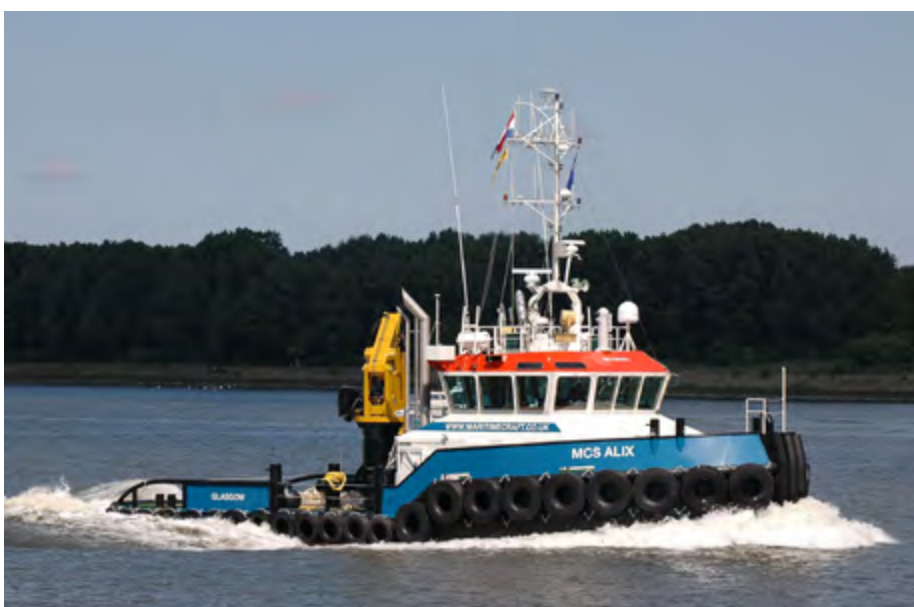
MCS ALIX United Kingdom

AHTS Winposh Rampart , ex Posh Rampart '12 (2012 – 9587934) owned by Win Offshore PT,