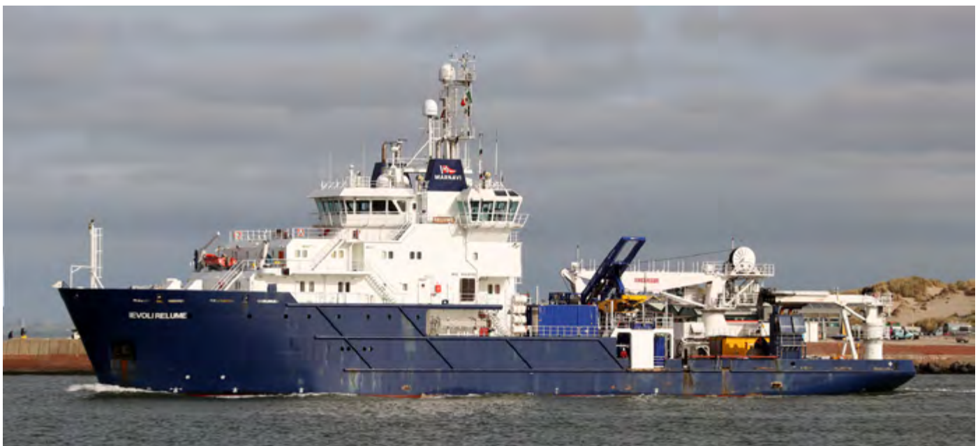
EVOLI RELUME United Kingdom