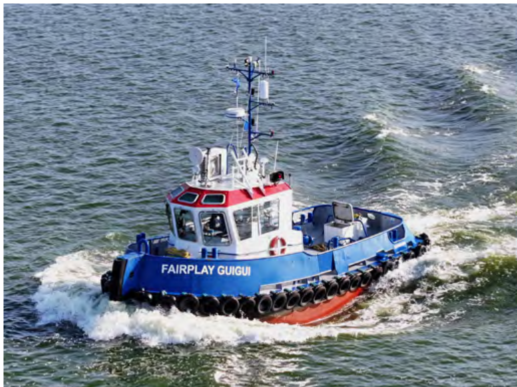
FAIRPLAY GUIGUI Germany

Tug Cheng Gang Tuo 11 (2023 – MMSI 413874923). Yard: Jiangsu Zhenjiang Shipyard. Dim. 35,50 x 9,80 x 4,50 m. Total: 4.497 bhp. Bollardpull: 52,5 tonnes, speed: 15 kn. Owner and operator: Jiangyin Chenggang Tug Shipping Co. Ltd., Jiangyin. Tug Hai Yu Tuo 16 (2023 – MMSI 413876733). Yard: Jiangsu Zhenjiang Shipyard. Dim. 38,00 x 10,00 x 4,70 m. Bollardpull: 62 tonnes, speed: 13,6 kn. Owner and operator: Taizhou Hongqiang, Taizhou. Tug Shan Gang Tuo 1 (2022 – MMSI 413336990). Yard: Jiangsu Zhenjiang Shipyard. Dim. 37,60 x 11,00 x 5,00 m. Total: 6.000 bhp. Bollardpull: 76 tonnes, speed: 14 kn. Owner