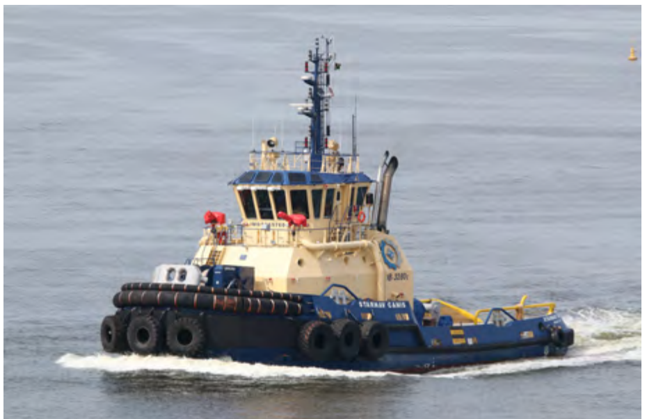
STARNAV CANIS Brasil