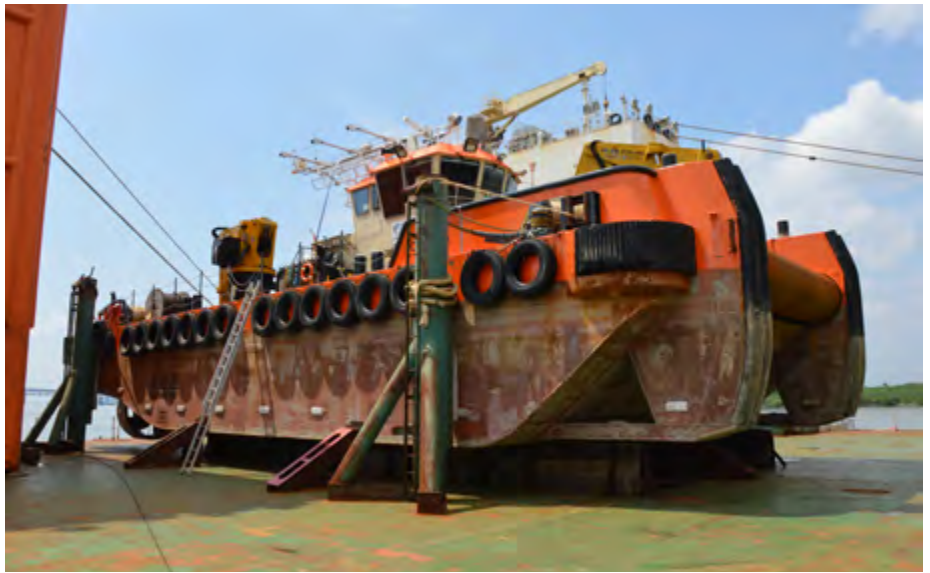
C-FENNA United Kingdom

Tug Winning Harmony 10 (2023 – 9788837). Yard: Jiangsu Suyang Marine Co., Yangzhong (CHN), ynr. 1582. 469 GT. Dim. 32,50 x 10,50 x 4,90 m. Engines: 2x Cummins, KTA50-M2, total: 3.649 bhp. Speed: 11