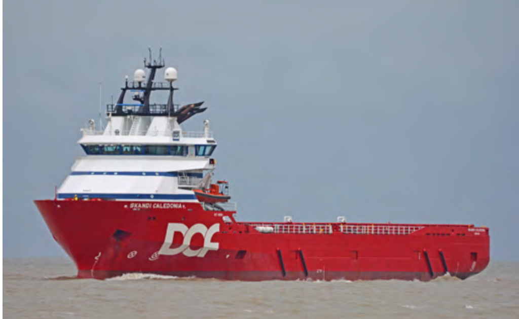
SKANDI CALEDONIA Norway

Tug Hikita No. 3 (2022 – 9952282). Yard: Kanagawa Zosen KK, Kobe, ynr. 769. 199 GT. Dim. 33,00 x 10,00 x ? m. Owner and operator: Tsurusaki Kairiku Unyu KK, Oitaken.