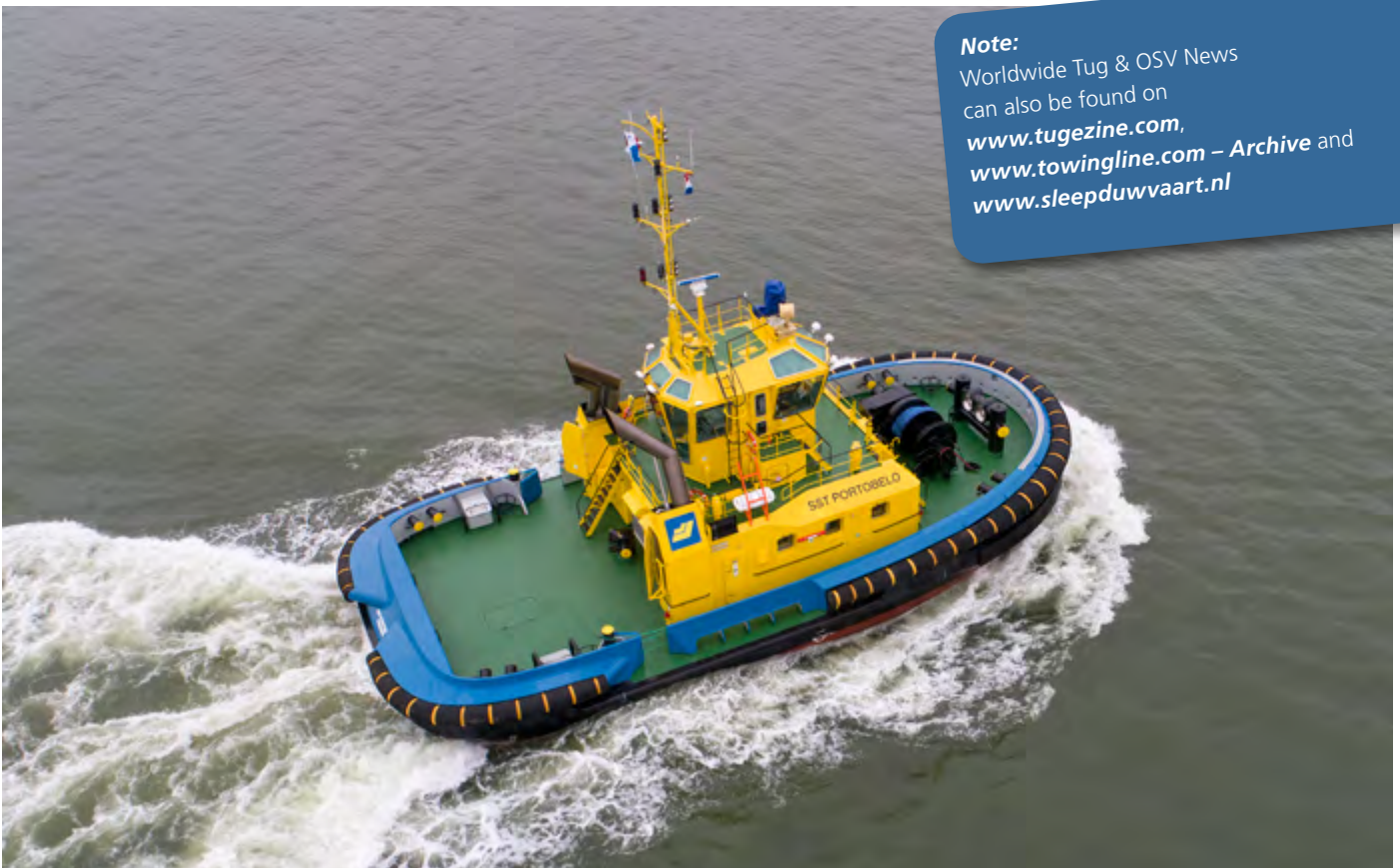
SST PORTOBELO Chili

Worldwide Tug & OSV News can also be found on www.tugezine.com , www.towingline.com – Archive and www.sleepduwvaart.nl