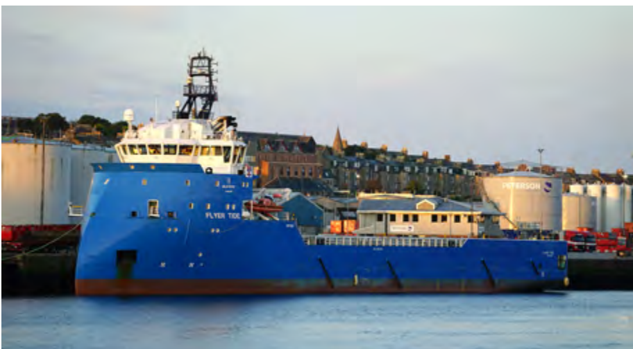
FLYER TIDE Norway

Pushertug Belen B (2023 – 1016018). Yard: Sapor Shipbuilding Industries, Sibuluan (MYS), ynr. Sapor142. 199 GT. Dim. 32,23 x 10,50 x 4,10 m. Engines: 2x Yanmar Power Technology, total: 3.616 bhp. Owner: Paranave SA, operator: Navemar SpA, Monte di Procida.