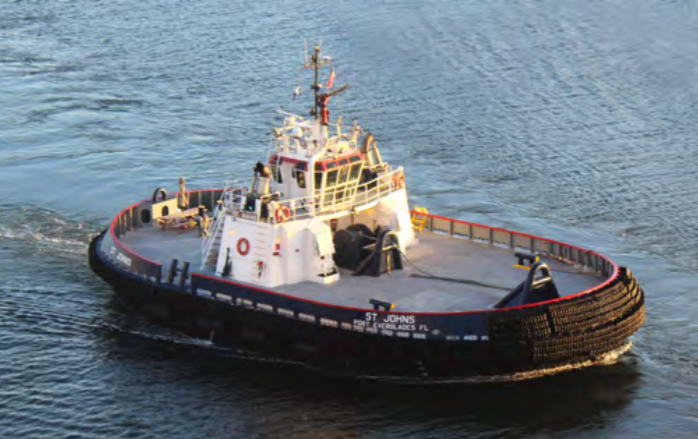
ST. JOHNS United States