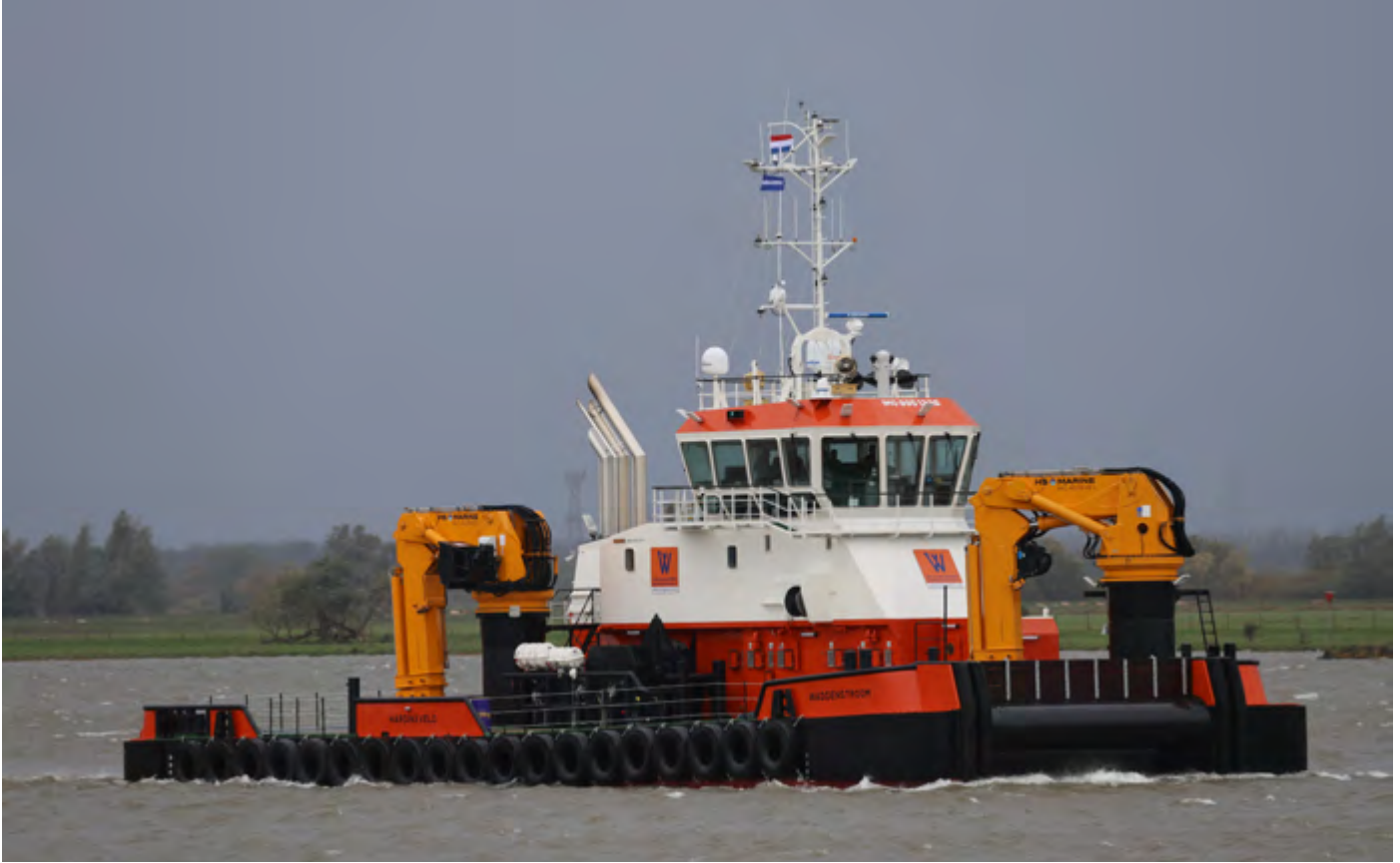
WADDENSTROOM The Netherlands