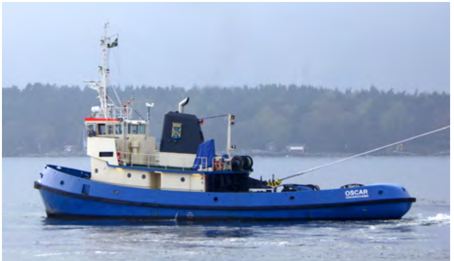
OSCAR AV OSKARSHAMN Sweden