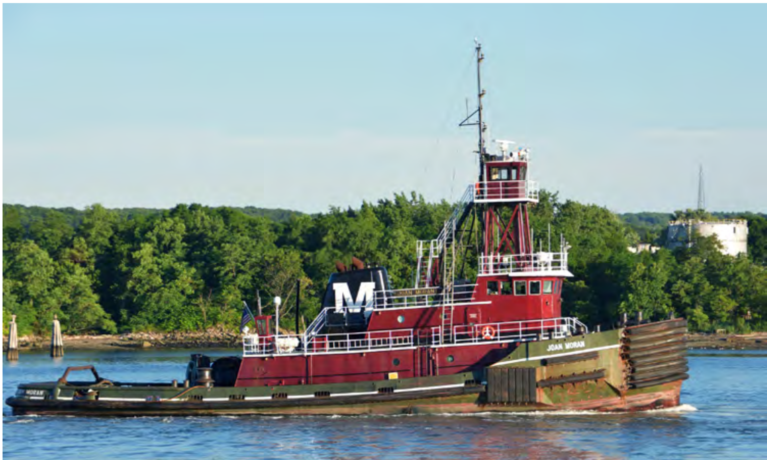
JOAN MORAN United States

Utility MCS Rosie 2 (2023 – 9909558). Multi Cat 2712 design. Yard: Damen Shipyards, ynr. 571815. 299 GT. Dim. 27,27 x 12,45 x 3,90