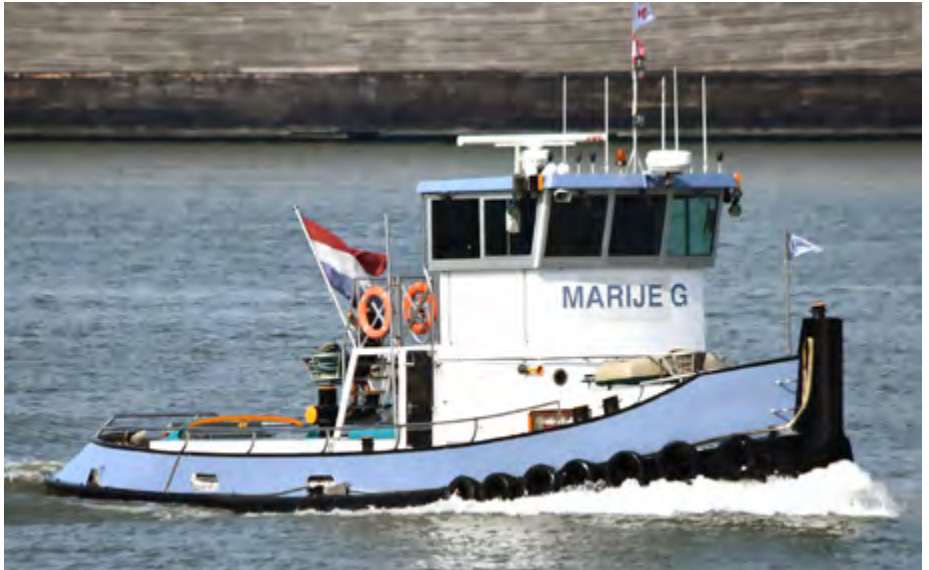
MARIJE G The Netherlands