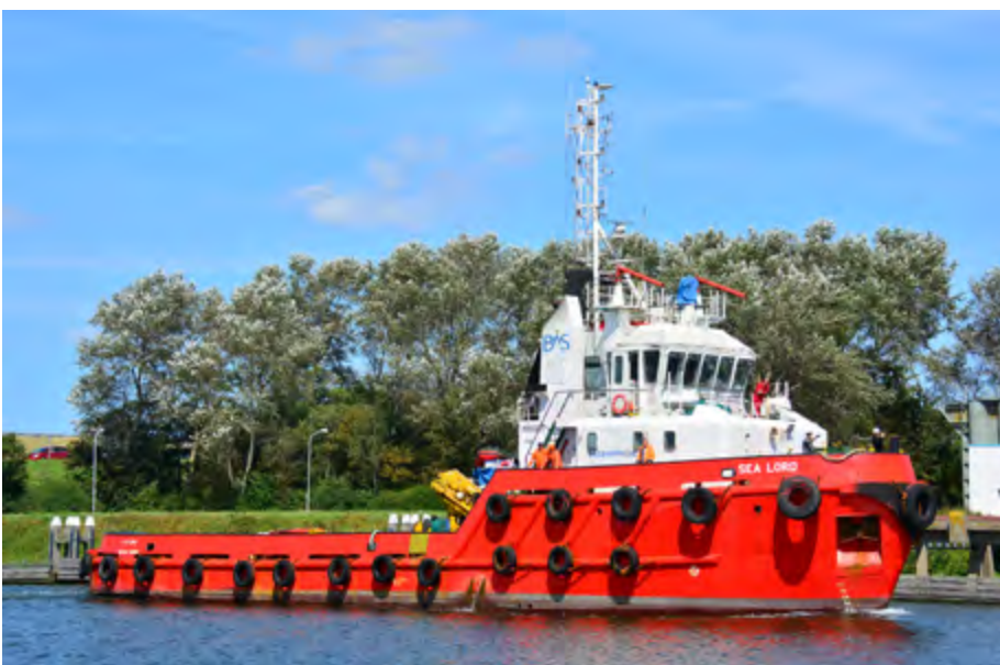
SEA LORD Ukraine