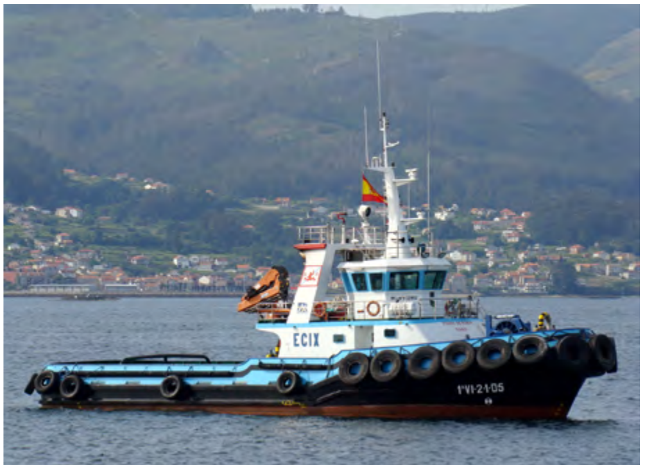
PUERTO DE MARIN Spain

Tug Jacques 4 (2023 – 9963865). ASD 2811 design. Yard: Damen Shipyards, Song Cam (VNM), ynr. 513217. 299 GT. Dim. 28,57 x 11,43 x 4,60 m. Engines: 2x Caterpillar, 3512-C TA HD/D, total: 5.102 bhp. Bollardpull: 60 tonnes, speed: 13 kn. Emission Standard: Tier III. Owner and operator: Société Chérefienne de Remorquage et d'Assistance, Casablanca.