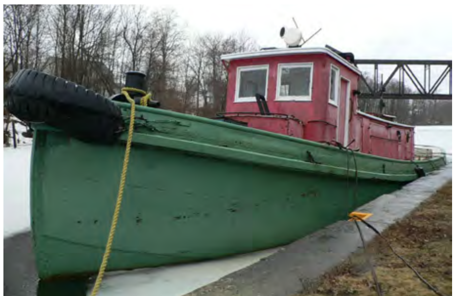
GROUPER United States

OSVs Armada 78.04 (2023 – 9924273) and Armada 78.05 (2023 – 9924285). VARD 960 design. Yard: Vard Vung Tau (VNM), ynr. 937 and 938. 2.373 GT. Dim. 72,60 x 15,44 x 7,00 m. Engines: 2x Cummins, QSK60-M. Owners resp. OI7804 Pte. Ltd. and OI7805 Pte. Ltd., operator: Ocean Infinity Group Sweden AB, Vastra Frolunda.