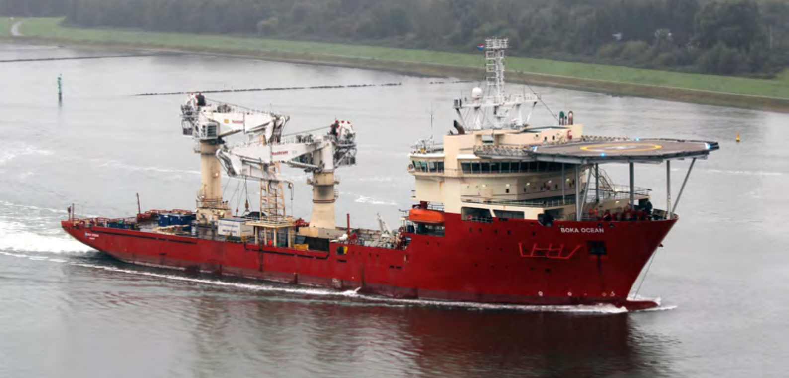
BOKA OCEAN United Kingdom