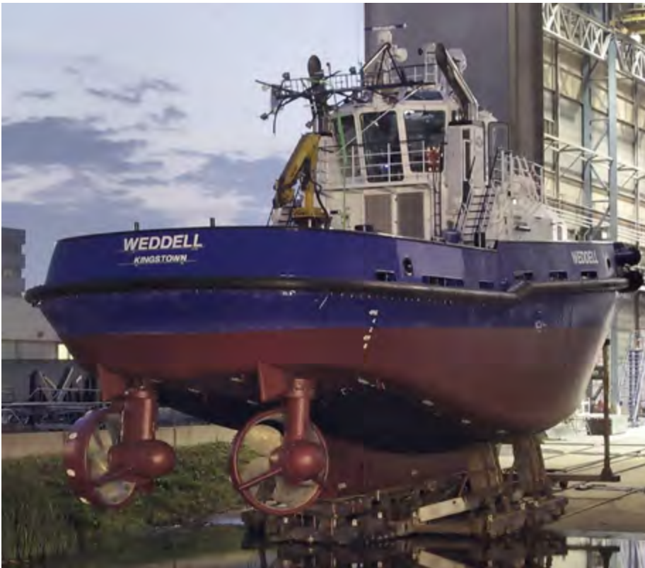
WEDDELL The Netherlands

Tug AGP Kartini I (2023 – MMSI 525501256). Yard: unknown. Dim. 27,40 x 9,00 x 4,12 m. Owner: PLN Tanjung Jati B, operator: PT Adhi Guna Putera. Tug EP 23 (2022 – 9975973). Yard: Muara Kembang Shipyard, Samarinda. 239 GT. Dim. 28,00 x 8,00 x ? m. Owner and operator: Epo Trans Abadi PT, Samarinda. Tug Gunung Ranai H-405 (2023). Yard: PT Noahtu Shipyard. Dim. 30,00 x 12,00 x 5,10 m. Bollardpull: 35 tonnes, speed: 12 kn. Owner and operator: Indonesian Navy. Tugs Harmony 55 (2022 – 9977543) and Harmony 57 (2022 – 9968700). Yard: Kukar Mandiri Shipyard, Samarinda, ynr. KMS 91 and KMS 93. 260 GT. Dim. 28,00 x 8,00 x ? m. Owner and operator: Duta Lintas Samudera, Samarinda. Tug MBP 3233 (2022 – 9885611). Yard: unknown. 286 GT. Dim. 32,20 x 9,00 x ? m. Owner and operator: Maritim Barito Perkasa PT, Banjarmasin. Launched as Tang Tiew Hee 82 . Tug MBS 2000 2 (2022 – 9957050). Yard: