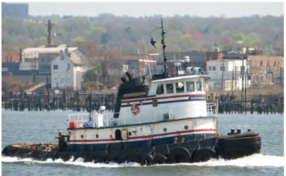
BUCHANAN 10 United States

Tug Med XLV (2023 – 9954084). Yard: Eregli Gemi Insa Sanayi Ve Ticaret, Karadeniz Eregli, ynr. 23,77 x 12,00 x 4,60 m. Total: 3.802 bhp. Owner and operator: Med Marine