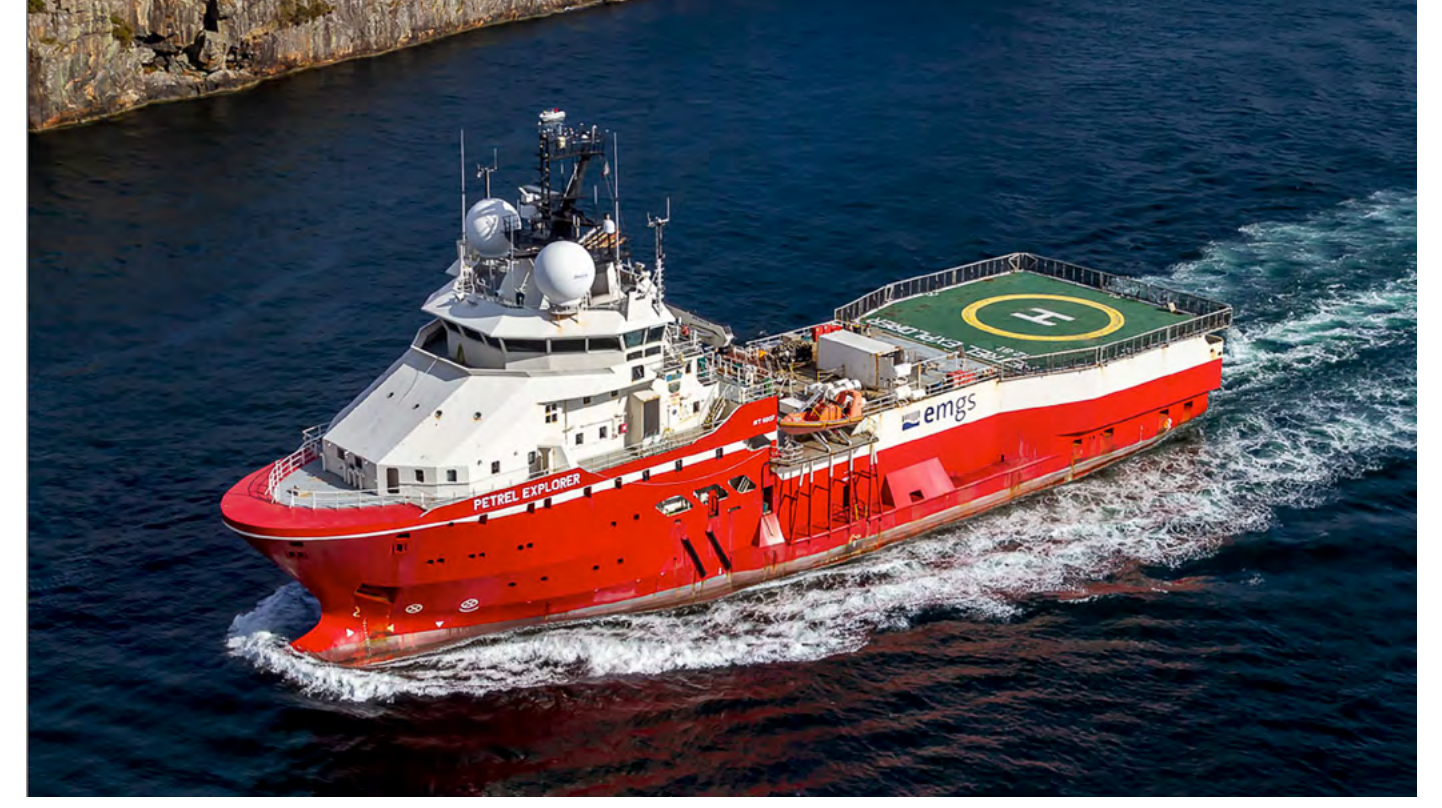
PETREL EXPLORER Norway