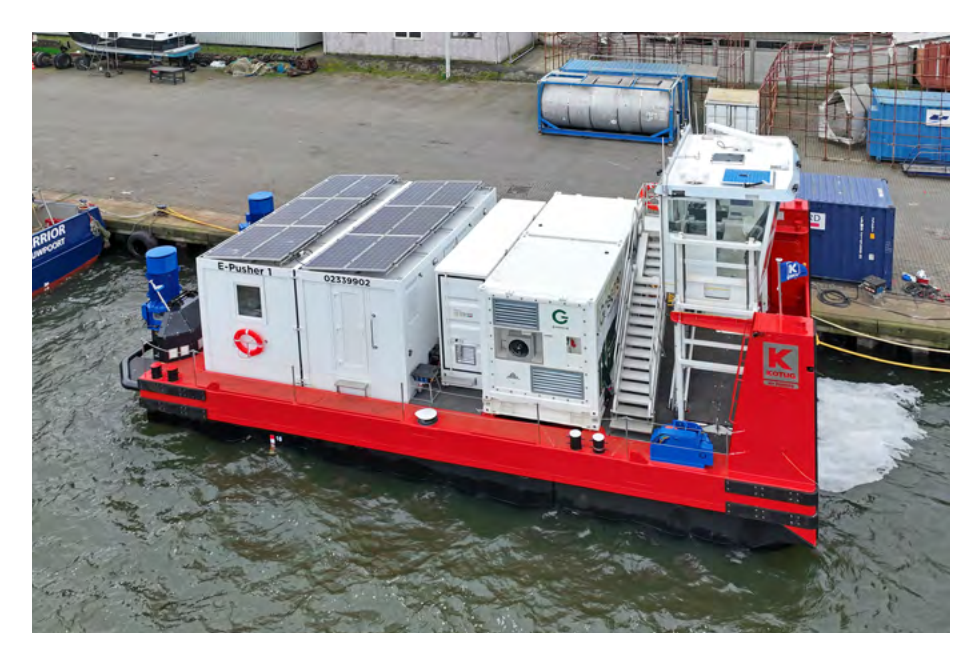
E-PUSHER 1 The Netherlands