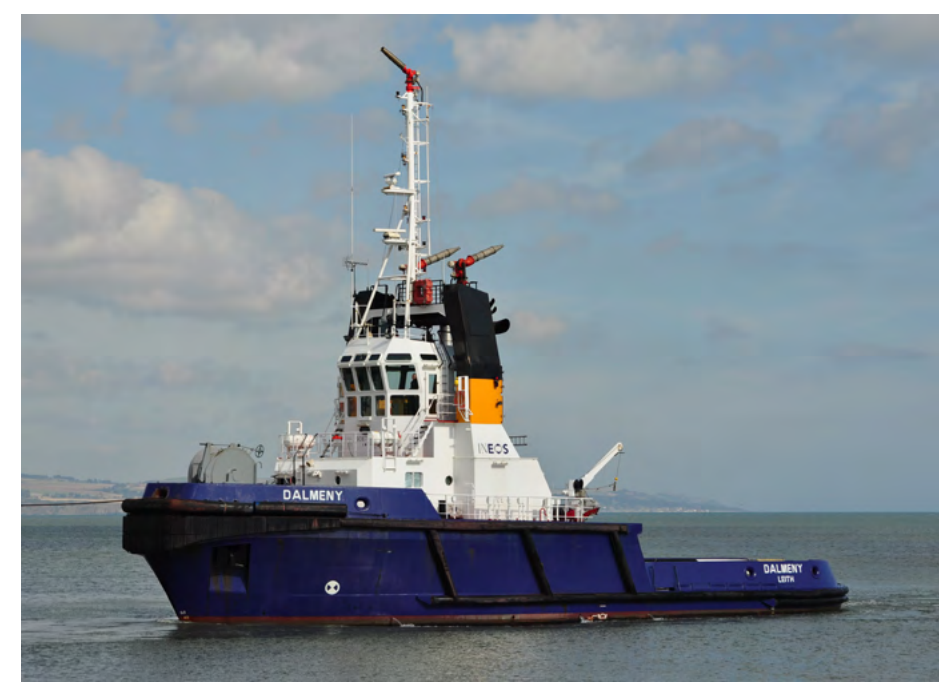
DALMENY United Kingdom

Tug Med XXXIX (2022 – 9954060) owned and operated by Med Marine Kilavusluk has been sold in 2023 to new owner and operator Abu Dhabi Marine Services Safeen and has been renamed Harbour Star 4 . Tug Enad 1 , ex Cakal II '13 (1990 – 8891637) owned and operated by Derintech Insaat Tahhut has been sold in 2021 to new owner