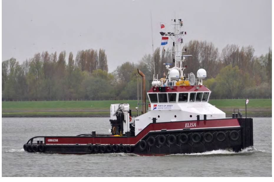
ELISA The Netherlands