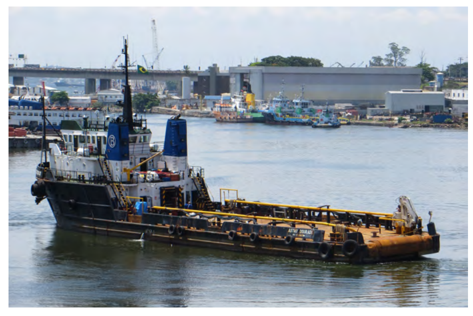
ASTRO DOURADO Brasil

Listed below are new constructions, renamings, sales, demolitions of tugs, anchorhandlers and offshore supply vessels that recently have taken place.