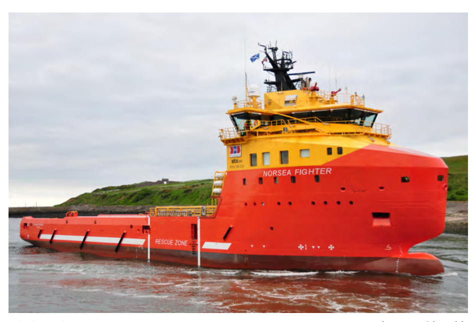
NORSEA FIGHTER Norway

Tug Sil-Jeske-B (2015 – 9769245) owned and operated by BMS Sea Towage B.V. has been sold in 2023 to Isa Towage B.V., Wijk bij Duurstede and has been renamed Isa .