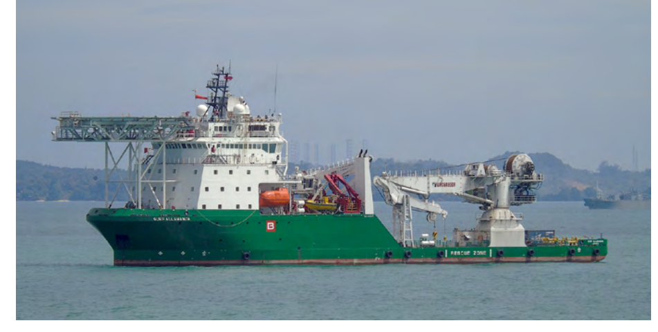
SURF ALLAMANDE Indonesia

OSV Sea-Watch 3, ex Alegrete '90, Seaboard Swift '95, Hornbeck Swift '96, BUE Gigha '99, Swift '99, Swift 1 '04, VOS Southwind