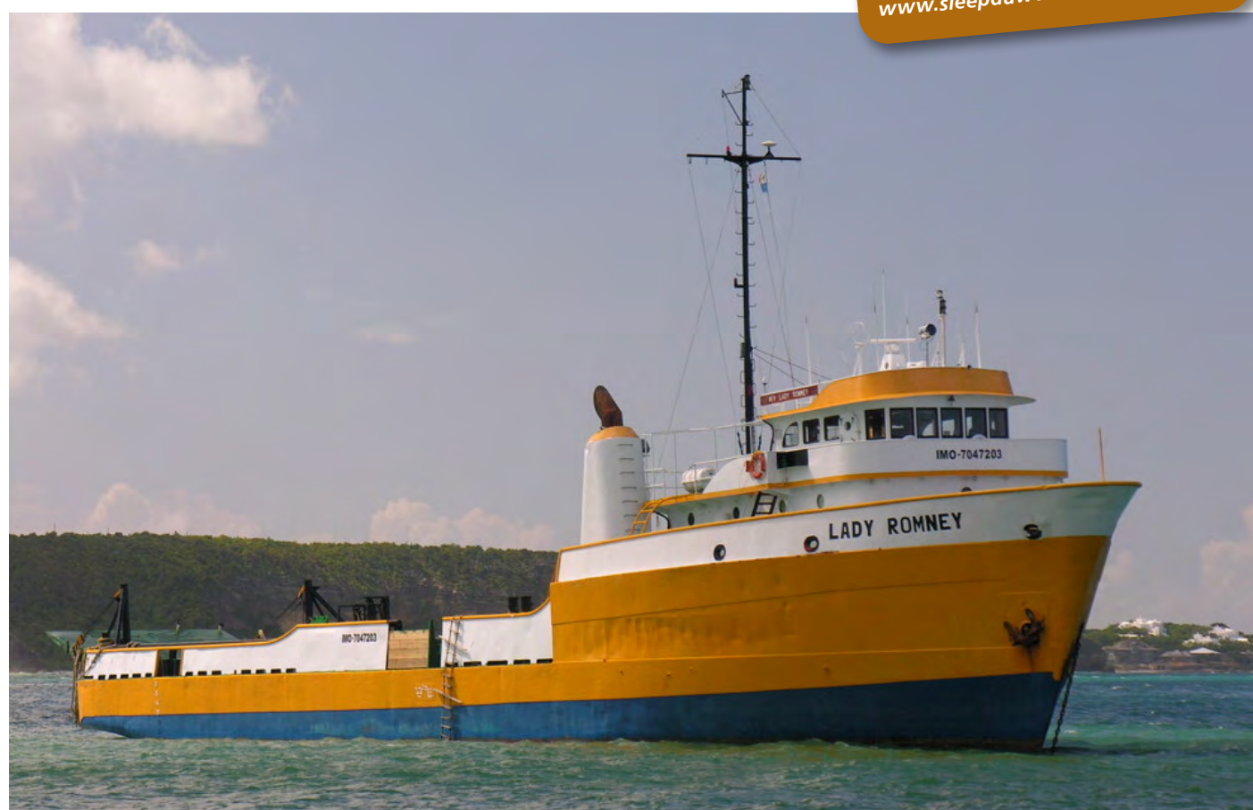
LADY ROMNEY Virgin Islands