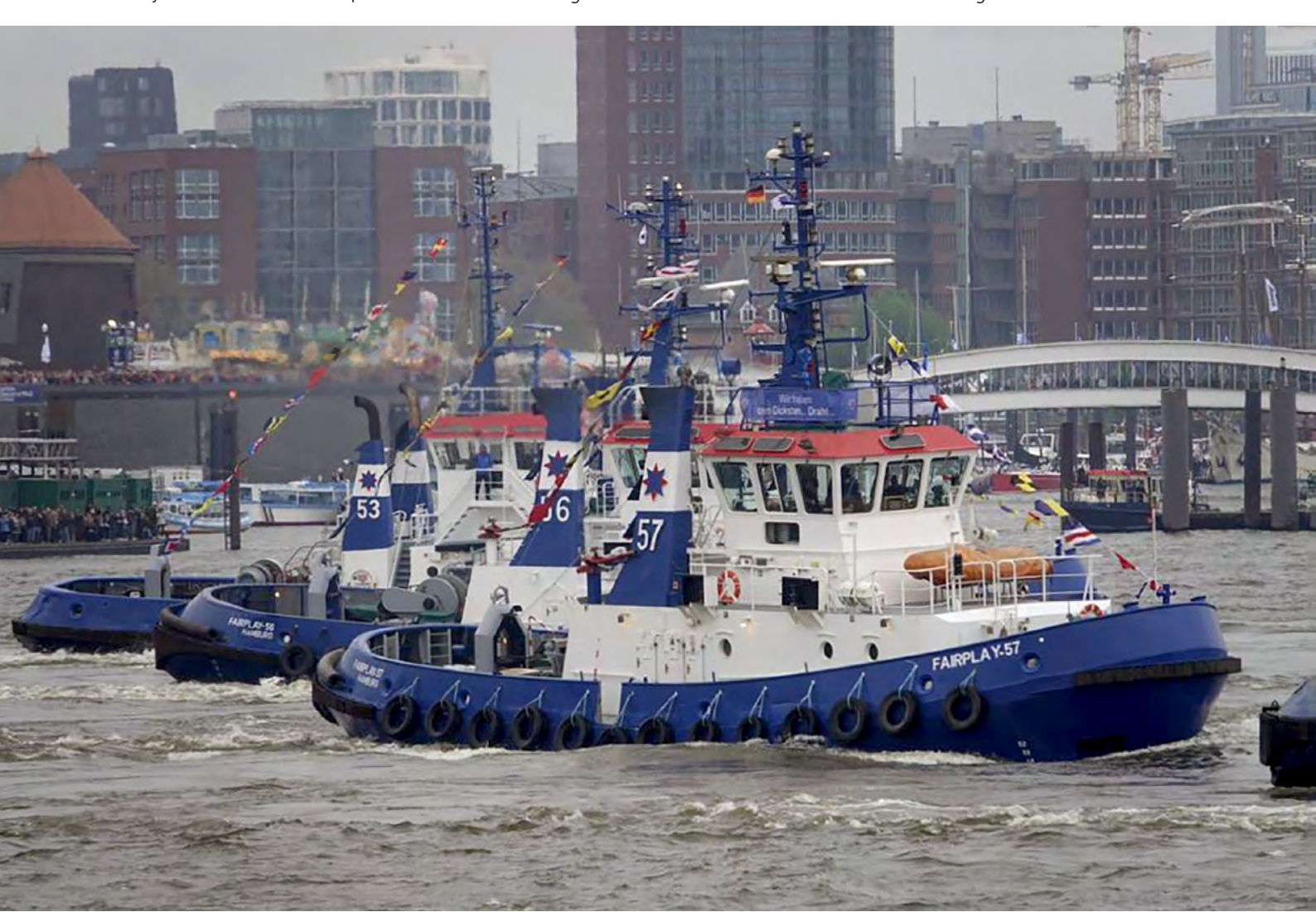
7 May 2023 Hamburg Hafengeburtstag

The editors regrets that the e-magazine is unable to supply photographs published in Worldwide Tug & OSV News.