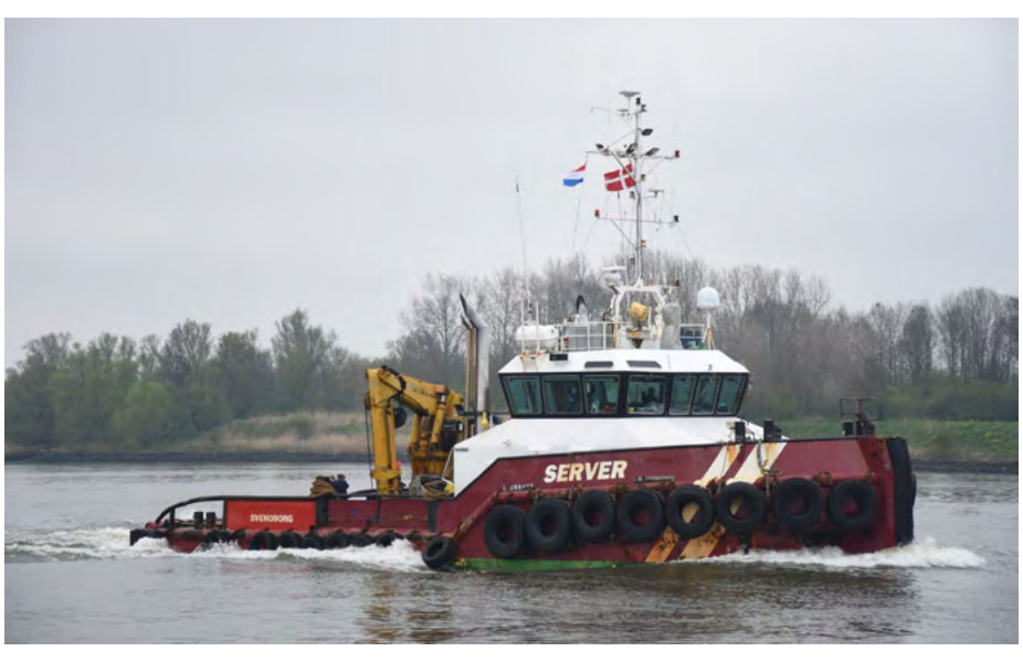
SERVER United Kingdom