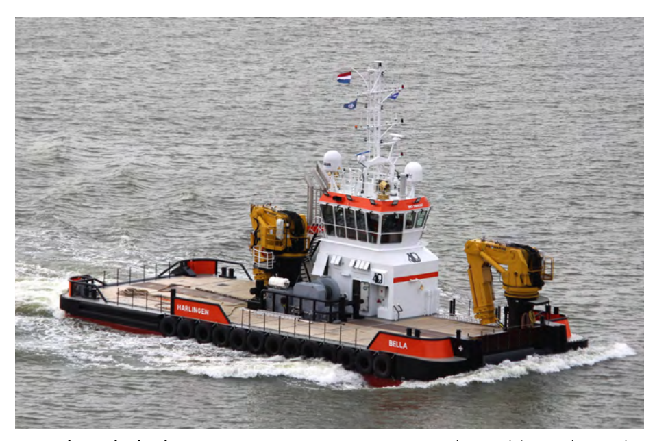
BELLA The Netherlands