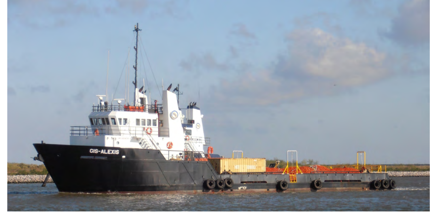
GIS-ALEXIS United States

Candies '95, Tecumseh '99, S/R Providence '02, Emma M. Roehrig '07, Greenland Sea '21 (1990 – 9032783) owned and operated by Dawn Barges LLC has been sold in 2023 to new owner EEF SPV3 LLC, operated by Centerline Logistics Corp. Seattle, WA and has been renamed Montlake.