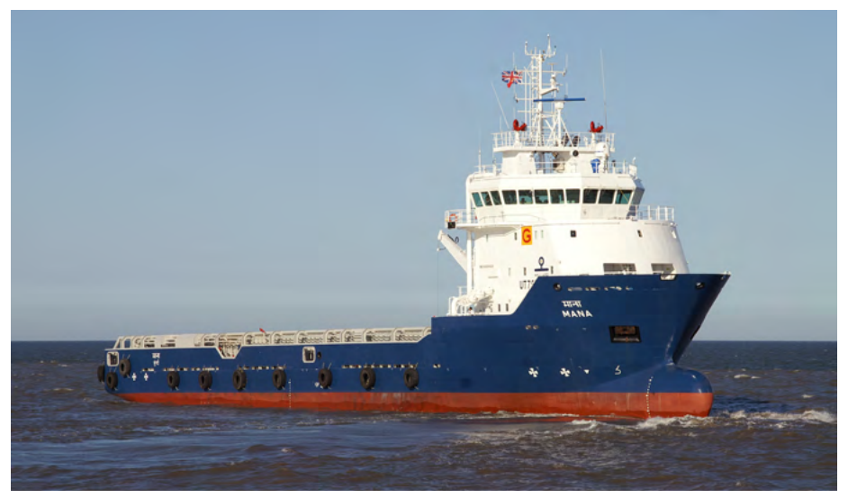
MANA India